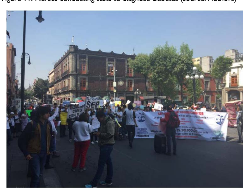
Figure 12: Protest against the education bill