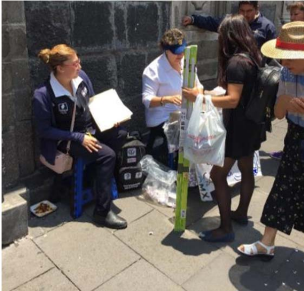
Figure 11: Nurses conducting tests to diagnose diabetes