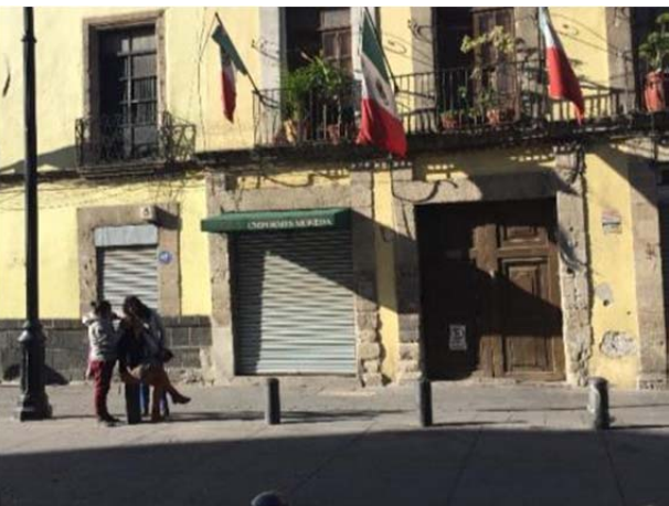
Figure 5: People eating on the street (left), woman doing hair treatment on the street (right) both in Moneda St.