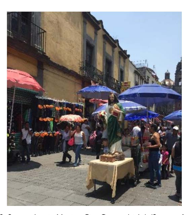
Figure 9: Street altar in Mexico City Centre (right) (Source: Authors).

celebration in which the whole community participates. Although prostitution is a practice which is not commonly associated with family values, the prostitutes of La Merced (a neighbourhood adjacent to MCC) gather together on this day and make their own public ofrenda (Castrejon-Arcos, 2012; Redacción ADN, 2015). Figure 10 illustrates how despite the laws, regulations and the social stigma, the prostitutes of La Merced temporarily appropriate the street to celebrate Día de los Muertos .