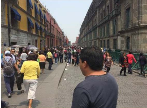
Figure 4: Street vendors hiding in buildings nearby (left). Street vendors have left the street (right)

As we have seen, the law regarding street use in MCC primarily protects the rights of pedestrians to have access to the street for transit. In further examples of commercial driven TA, citizens as both consumers and entrepreneurs have found ways to work around the law, for example by placing small chairs and tables right next to the edge of a building (see Figure 5 left). The street which remains a viable place for transit thus simultaneously also becomes an open-air dining area. Similarly, in the example illustrated in Figure 5 (right), a hair treatment is being carried out using a bollard as a hairdresser's chair, with the street becoming briefly an urban salon.