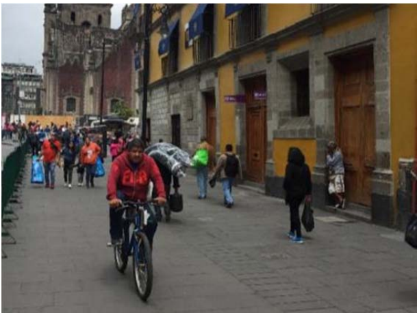
Figure 3: Street vendors in Moneda St. (left), Street vendors' guardian with walkie-talkie (right)