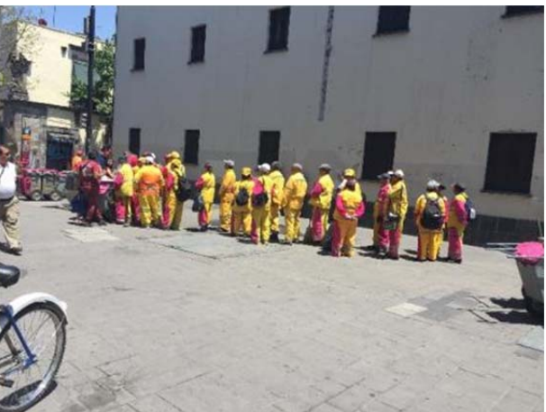
Figure 6: Police officers in an ordinary morning meeting (left), refuse collectors getting their weekly payment (right) both in San Jeronimo St.