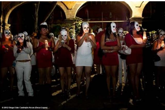
Figure 10: Prostitutes celebrating Dia de los Muertos in La Merced