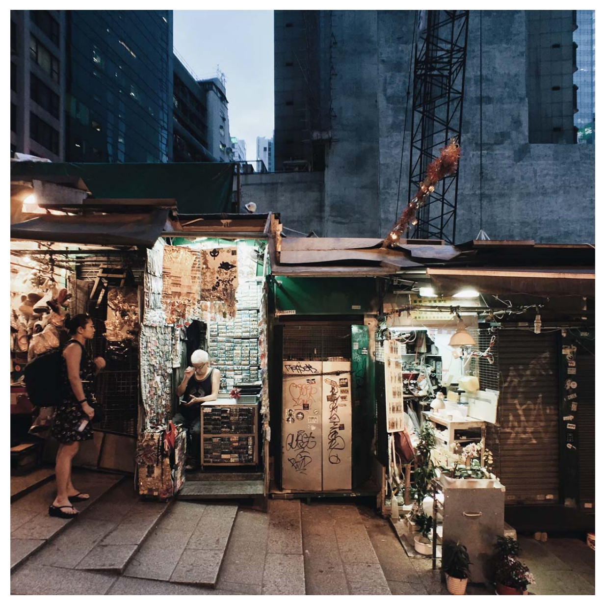
Street stalls in Central.

It is true that hiking trails or countryside parks are never far from the city, but they are also not as close to an extent that could be accessed on a daily basis. We all need public space to take a deep breathe, to smoke, to take a walk with our dogs, or just to embrace the warmth from the sun to clear one's mind - such space might be commonly available in some other cities that are less dense, yet they are not easily found in most districts in Hong Kong. In Hong Kong, streets took over such responsibility for even more spontaneous social interactions.