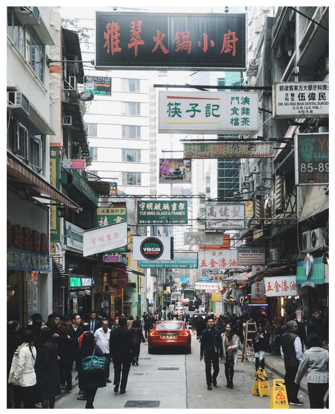
Overcrowded pedestrian way in Central.

2. Unique way that some public spaces are being used, based on the urban constraints Street photography has a lot to do with capturing an extraordinary moment out of the ordinary. To apply that into the observation of public space, one would begin to notice how some spaces are being used differently than their original intents.