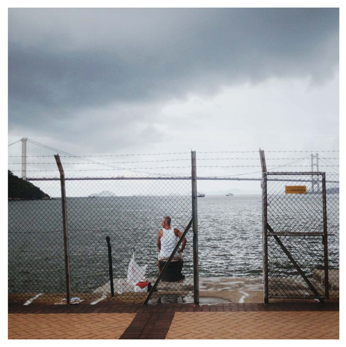
Door to the Nature behind the gate .

Even when available, they could sometimes be too slow to catch up with the population growth & redevelopments. These small open spaces serve up to thousands of people per day, management rules were implemented for easier management and they do not allow certain activities to happen.