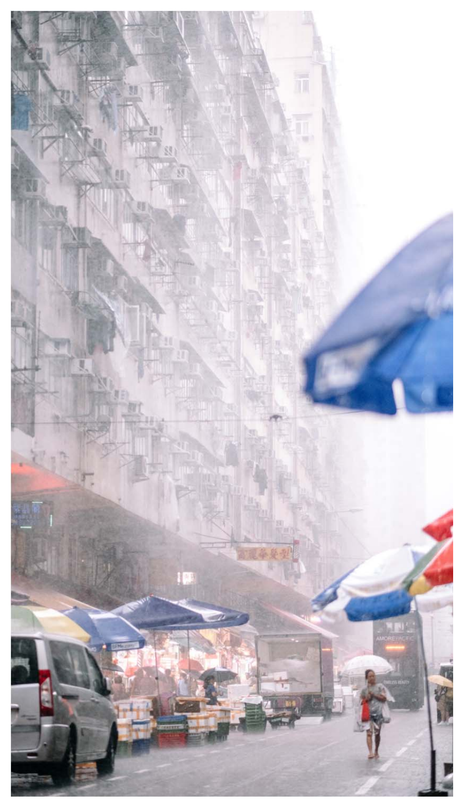
Open street wet market + tramways in North Point.