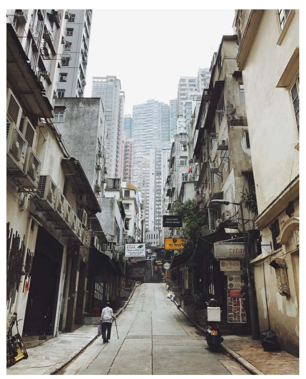
Solitary on a slope.

An interview with Zolima Citymag in 2018<sup>1</sup> summarized very much on how I see the importance of public space in Hong Kong: 'it's not the buildings that make a city special, it's the space in between them.' Buildings could look the same over time, but the activities in the space in between never repeat.