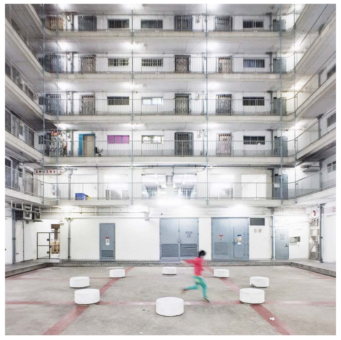
Courtyard of a public housing tower in Hong Kong.

Photographing urban space has always been my interest, even before I entered architectural school and began my career as an architect. When I was still at school, I already enjoyed observing, through my camera, on how the complex yet limited public spaces in Hong Kong accommodated the diverse and spontaneous street life. Studying &