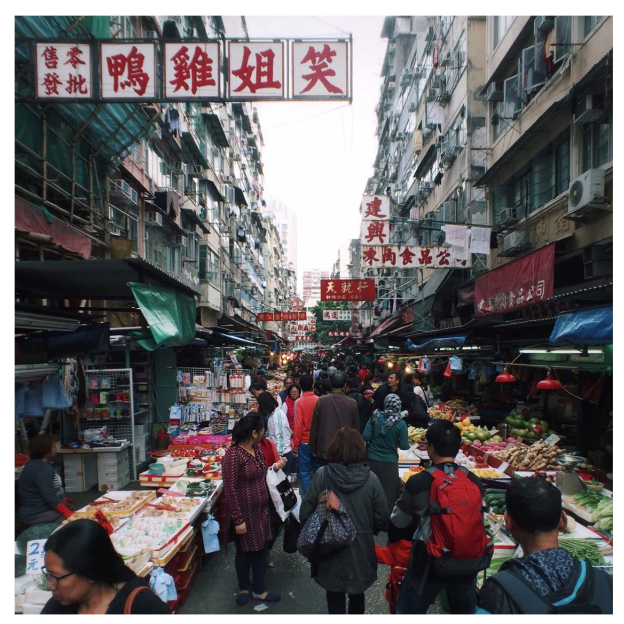
Jordan street market.

demands of activities shaped such public space throughout history. Best examples are the street markets in Hong Kong.