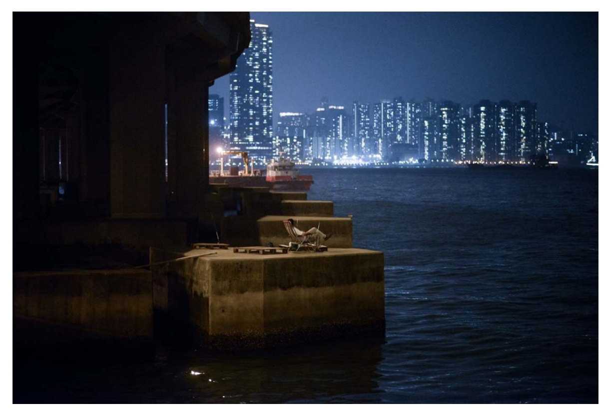
Solitary at waterfront in Noint Point.