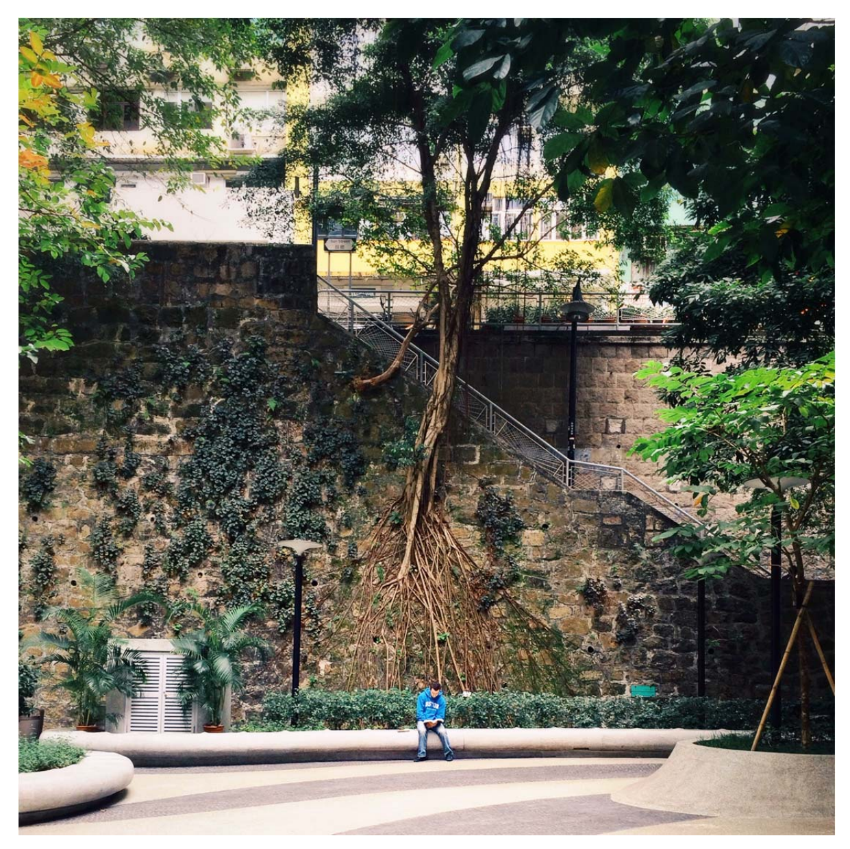
Reading in a planned park with an unplanned plant.