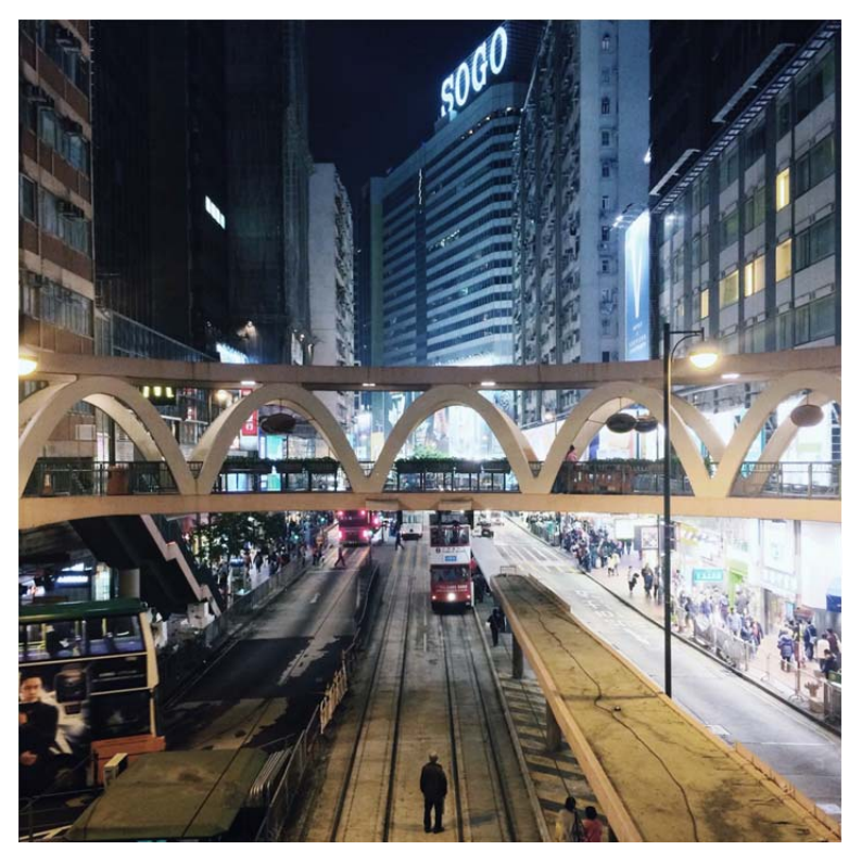
A second of solitary.