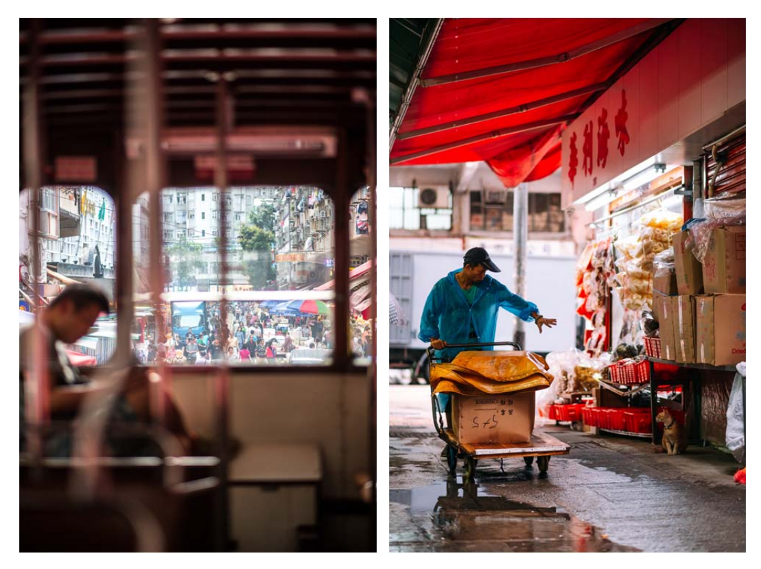
(On the left) Solitary on a tram surrounded by noise. Picture by Kevin Mak. (On the right) Store-cat of a dry food store. Picture by Kevin Mak.

The Journal of Public Space, 4(2), 2019 | ISSN 2206-9658 | 209 City Space Architecture / UN-Habitat