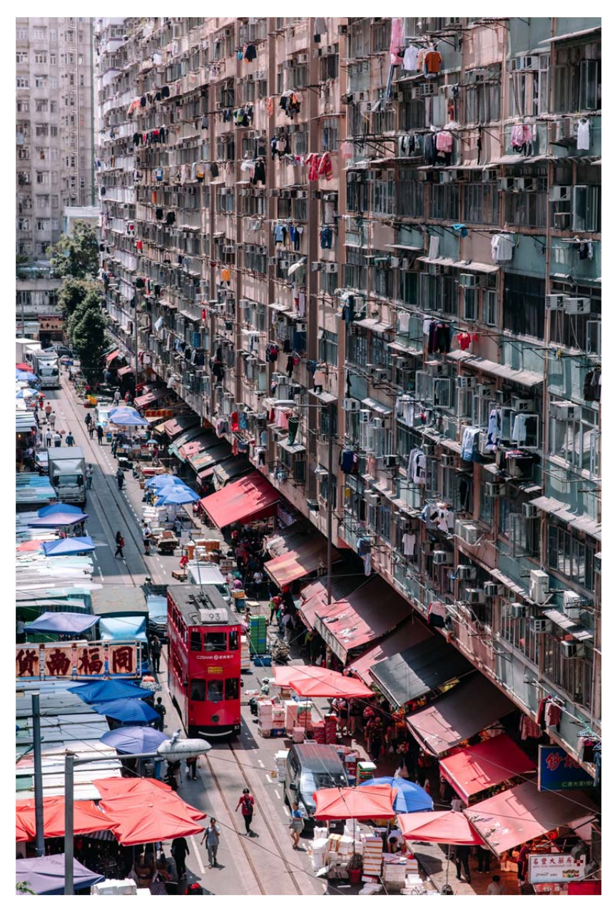
Open street wet market along tramways in North Point.

In many older parts of Hong Kong, the streets are full of cluttered shop signs, informal stalls, and vernacularly modified building facades with air-conditioners and clothes hanging racks. These simply offer rich textures as an urban backdrop - a public stage. The major differences of such stage from a newly built, green open space are the organic nature of the space and its history.