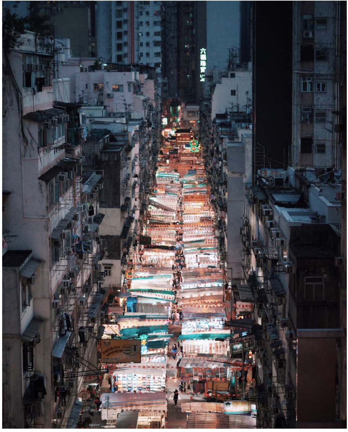
Temple Street Market in Yau Ma Tei.

Photographing a scene like this could be similar to the process of creating an art collage. Elements come into and leave the frame continuously. They are never artificial as they represented a certain balanced reality that is reflecting the necessity in life. It could be overwhelming for someone not looking for urban life - but someone like myself would see it as a paradise full of resources as if we are animals in a tropical rainforest that is full of possibilities.