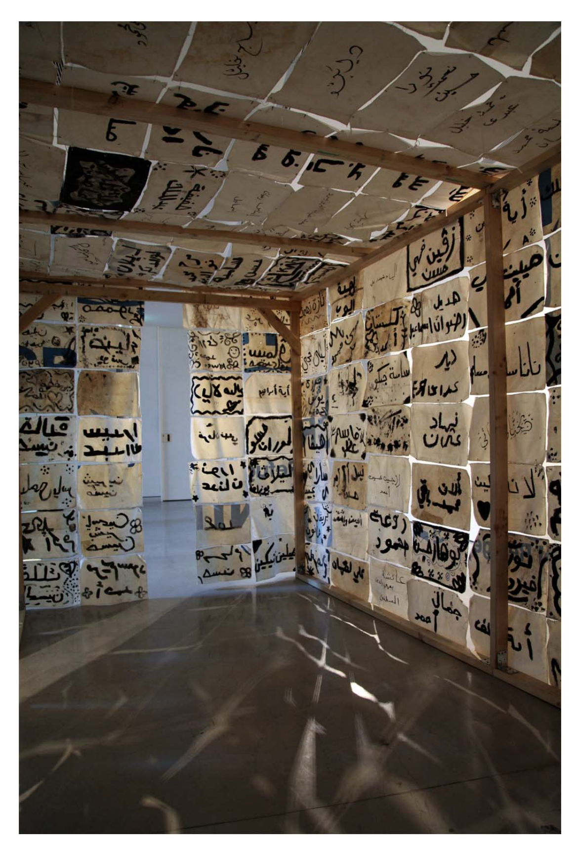
Figure 13. Installation Patterns of Displacement, UTS University of Technology Gallery, Sydney, Australia, 2017.