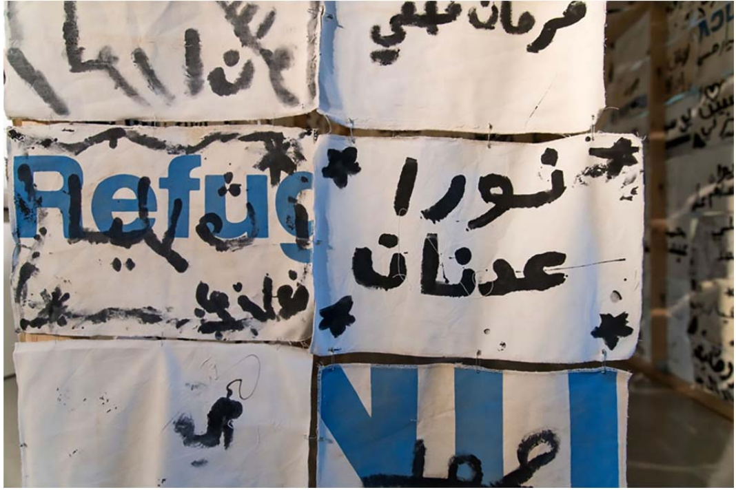
Figure 2 and 3. Installation detail, Patterns of Displacement, UTS University of Technology Gallery, Sydney, Australia, 2017.

From September 2016 to February 2017, I worked in several refugee camps in the Kurdistan region of Iraq. I encountered refugees from a diversity of backgrounds (Yazidi, Christian, Shabak, Sunni, Kurdish, Arab, Syrian and other minorities).