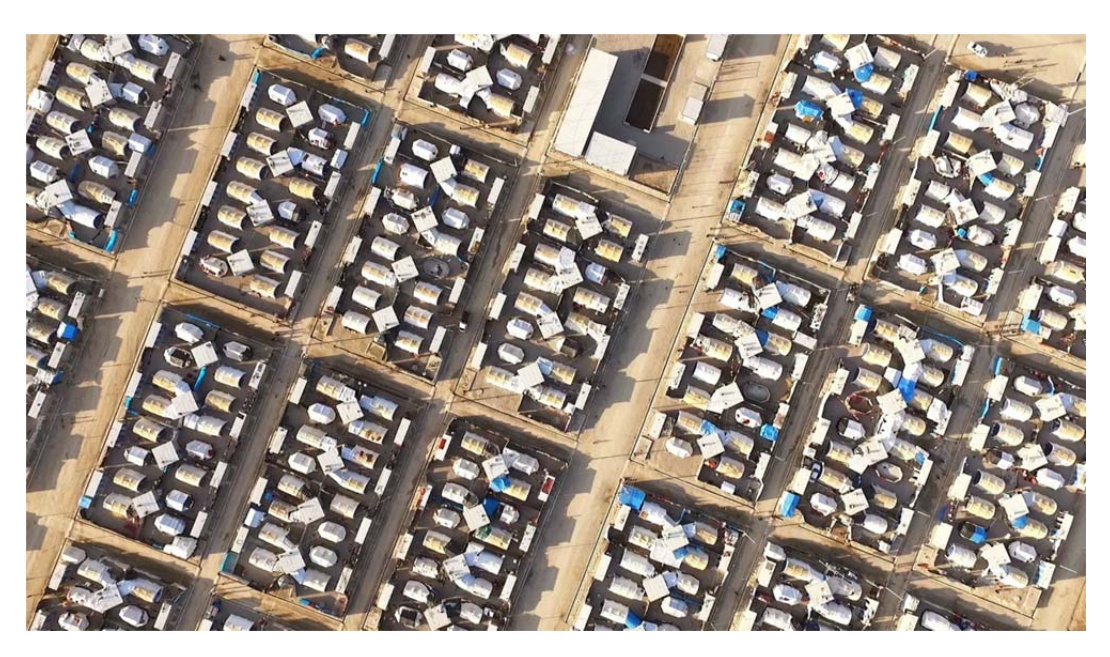
Figure 4. Repetition of patterns. Overview of section of Arbat Refugee Camp, December 2016.