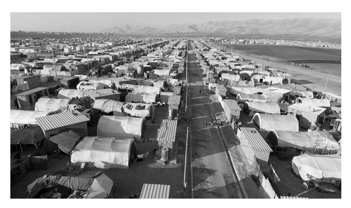
Figure 5. Repetition of patterns. Overview of section of Arbat Refugee Camp, December 2016.

The projects<sup>2</sup> that I produced within the camps focused on the daily living conditions of the refugees.