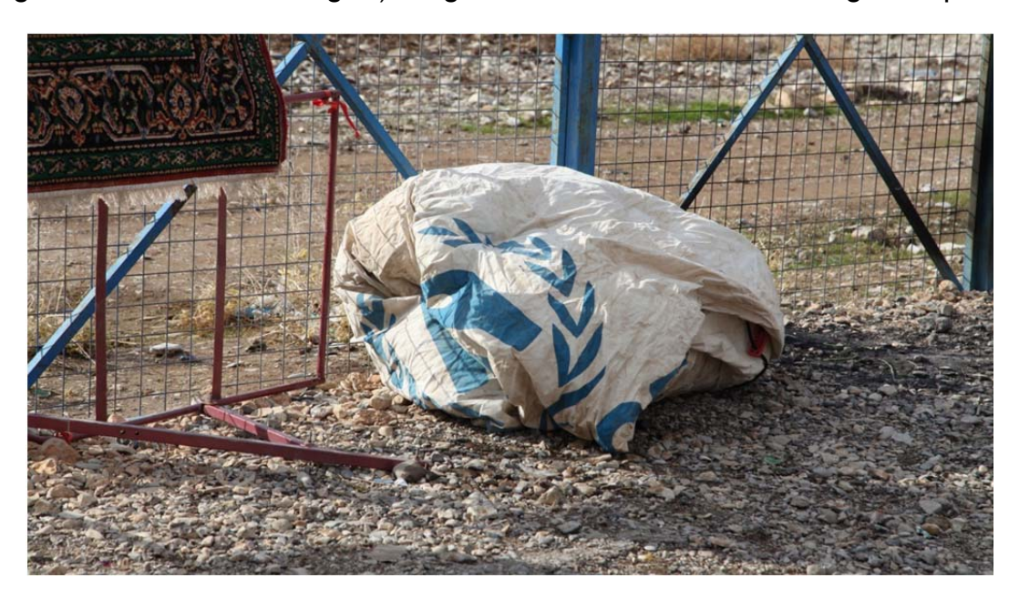
Figure 6. Disgarded official UNHCR refugee tent used for the project.

For "The Patterns of Displacement", I used a discarded official UNHCR (United Nations High Commissioner for Refugees) refugee tent that I found in Arbat refugee camp.