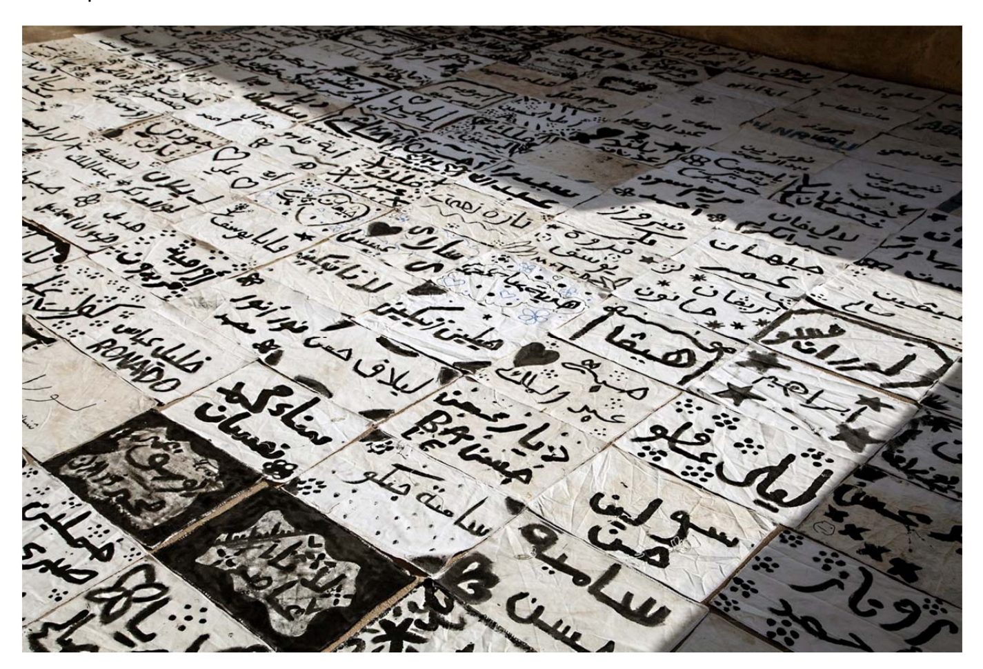
Figure 7. Texts repeat patterns of the camp.

placed in an exceptional, invariably detrimental relationship to legal procedure and political discourse."3