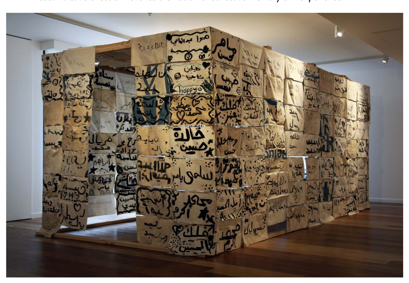
Figure 12. The Patterns of Displacement. Installation view at MARS Gallery, The Notion of Place and Displacement, solo exhibition, Melbourne, Australia 2017.

Through the process of deforming and reforming the tent, the purpose and meaning of this tent shifts - from international aid agency; to refuge for the nameless; to a monument as testimony – as a paradoxical object loaded with absence recalled through the names emblazoned on this tent as communal gathering space. A space that clearly indicates the names of children that has become a hub of remembrance in the face of political violence and conflict. The assembling of this collection of written names has an accumulative effect and evokes the notion of collective memory and experience.