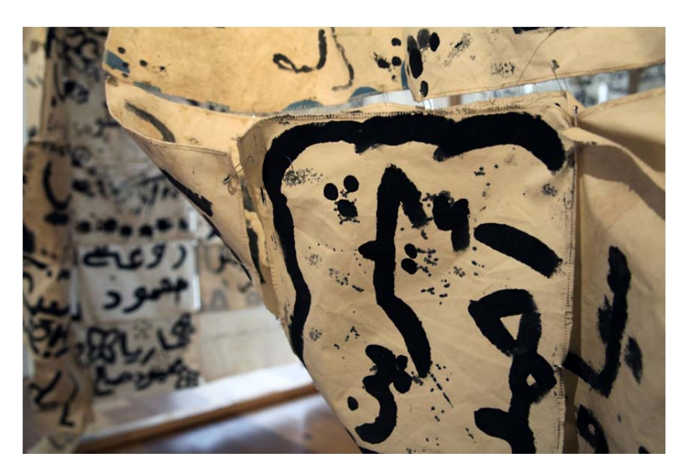
Figure 14. Detail of pieces joined together with safety pins. UTS University of Technology Gallery, Sydney, Australia, 2017.

Caterina Albano writes: "... In this context, the object acts as an icon that transitions from individual trauma to collective history, from personal pain to public horror, entangling questions of remembrance and documentation with emotional susceptibility".