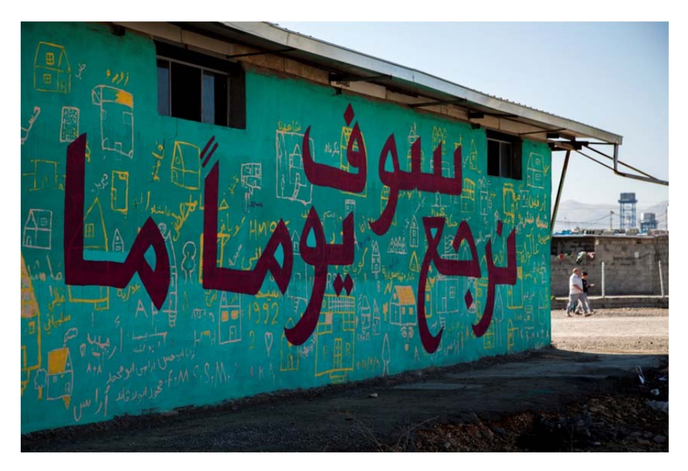
Figure I 5. A collaborative public art project done by a group of refugee kids as street art at Arbat Refugee Camp, December 2016. The text in Arabic says 'ONE DAY WE WILL RETURN'. Rushdi Anwar was not directly involved with this project but found it a powerful statement.

"The Patterns of Displacement", evokes the dreadfulness of displacement, conflict and violence. Through this work I try to make sense of this nonsensical world.