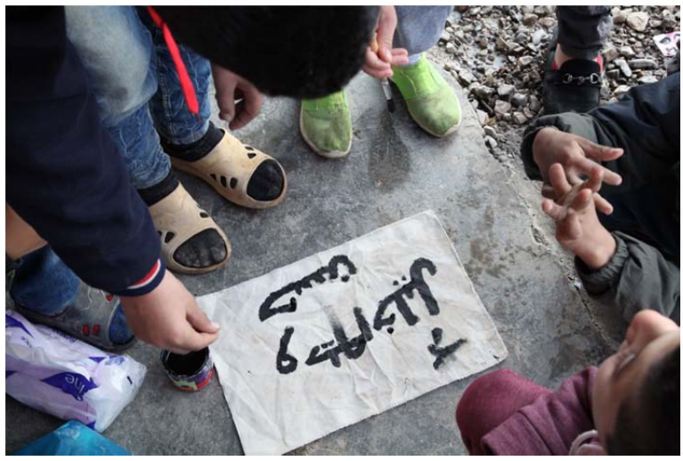
Figure 10 and 11. Writing names on the fabric, roadside, Arbat Refugee Camp, December 2016.

The UNHCR tents are historical objects, distinct realms that should not be separated from the history of conflict in the region. "The Patterns of Displacement", brings the past and the current traumatic political events together (the war against ISIS and even post ISIS) as a sort of archive; containing layered narratives about refugees, displacement, war and broader histories of conflict, communal memory, revisioned history and the relationship between east and west, and much more. Such an archive questions our consciousness of the assumption of content and context of war, the tent becoming a document of located communal memory sharing the loss and tragedy of home and loved ones.