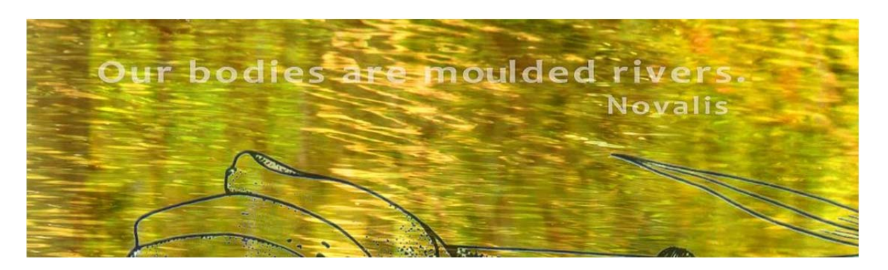
Figure 5. Detail of Reflections from the Tanks Cairns Botanic Gardens Visitors Centre. Digital Art glass and LED panel lighting (2012).

The artwork and infrastructure can also be created in collaboration between artist and architect. From 2016 to 2018 I created a collaborative work in Darwin with Liquid Blue, Architects and in particular with Daniel Hahn. As the commission involved the reconstruction of the Parap Pool, the theme 'Under the surface' (Figures 6 and 7) was the bodies interaction with water<sup>1</sup>. The final entrance sculpture and 70 linear meter facade melded art with architecture.