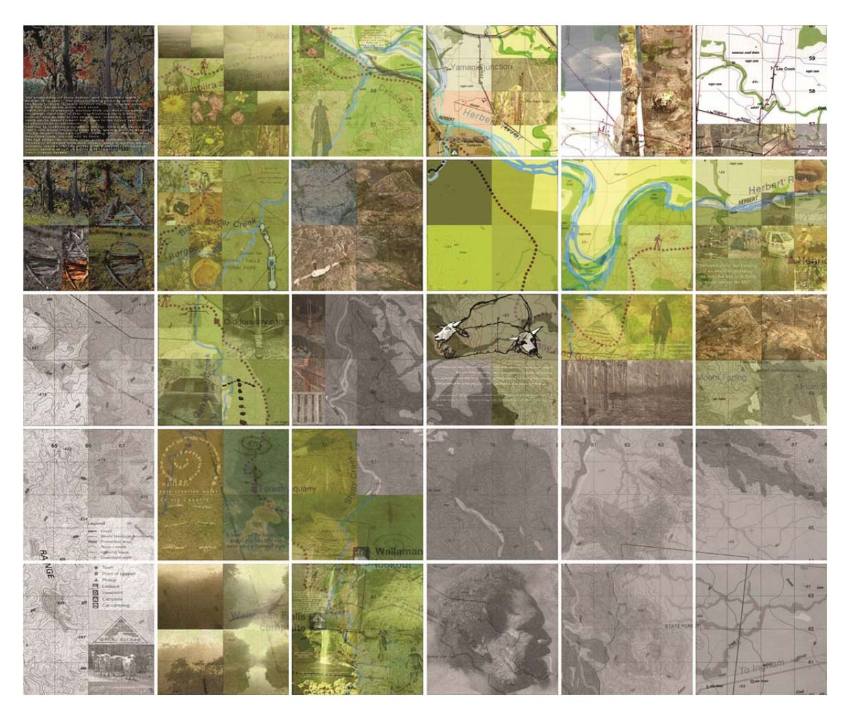
Figure 8. Detail from Marking Time currently in the Powerlink collection in Brisbane, Australia. Digital Art, Photographs and drawing on paper 2.4m x 2m (2006).

There are also some rare cases where the public work is impermanent. In 2006 the Environmental Protection Agency EPA in league with Queensland Parks and Wildlife decided to open up a number of 'Great Walks' along the Queensland Coast. I was the artist nominated for the 'Wet Tropics – Great South Walk' from Wallaman Falls to Henrietta Gate 56.8km, known as the 'Jagany' (goanna) walk. A unique public art experience, this commission was called 'Marking Time' (Figure 8), and opened the possibility for me to create ephemeral work and create poetry from the experience of undertaking the walk. The final work integrated the parks and wildlife map with topographical maps of the area, photographs of the experience and poetry created during the walk.