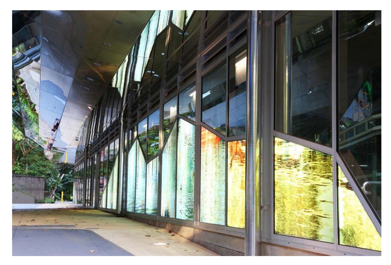
Figure 4. Reflections from the Tanks Cairns Botanic Gardens Visitors Centre. Digital Art glass and LED panel lighting (2012).