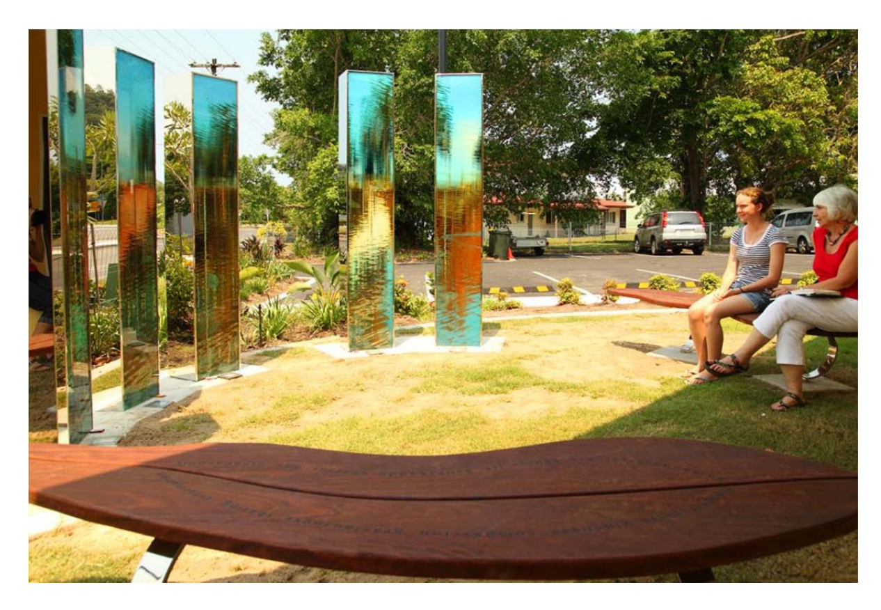
Figure 2. Sharing at the Marlin Coast Neighbourhood Centre, Digital Art Glass Reflective Stainless-steel panels wood and polished stainless steel, 2011 (Source: Jill Chism).

I will now elaborate each one of these variables. Starting with the situation where the commissioned artwork is tacked on to an already built structure . An example of this is my commission for an entrance sculpture for the new Marlin Coast Neighbourhood centre, 'Sharing' (Figures 2 and 3). An essential aspect of this work was that it created a space where visitors could gather and converse. However, the central theme of this work is the question of ecological imbalance created by the making of the new suburb of Trinity Park. One of the fallouts of development was the large amount of cleared land. In this work I researched the types of trees that were being replaced and using reflections text and images of fallen leaves, I reminded viewers of our relationship to the natural environment, the histories of the site and the nature/culture conflict that is inevitable with development.