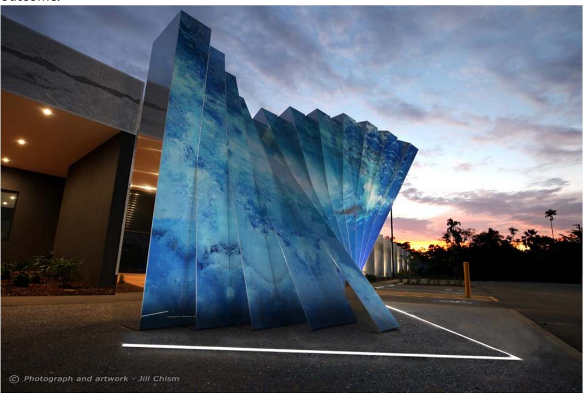
Figure 6. Under the Surface Parap Pool Darwin, Digital Art Glass, Pic Perf, Dibond reflective panel (2018).

In addition to adopting the use of 'Pic Perf' or perforated aluminium, I also used reflective materials and glass while merging the zig zag formation of the façade with the motion of an ocean wave to create the entrance sculpture. The finished artwork and building are particularly striking because both artist and architect were committed to the best possible outcome.