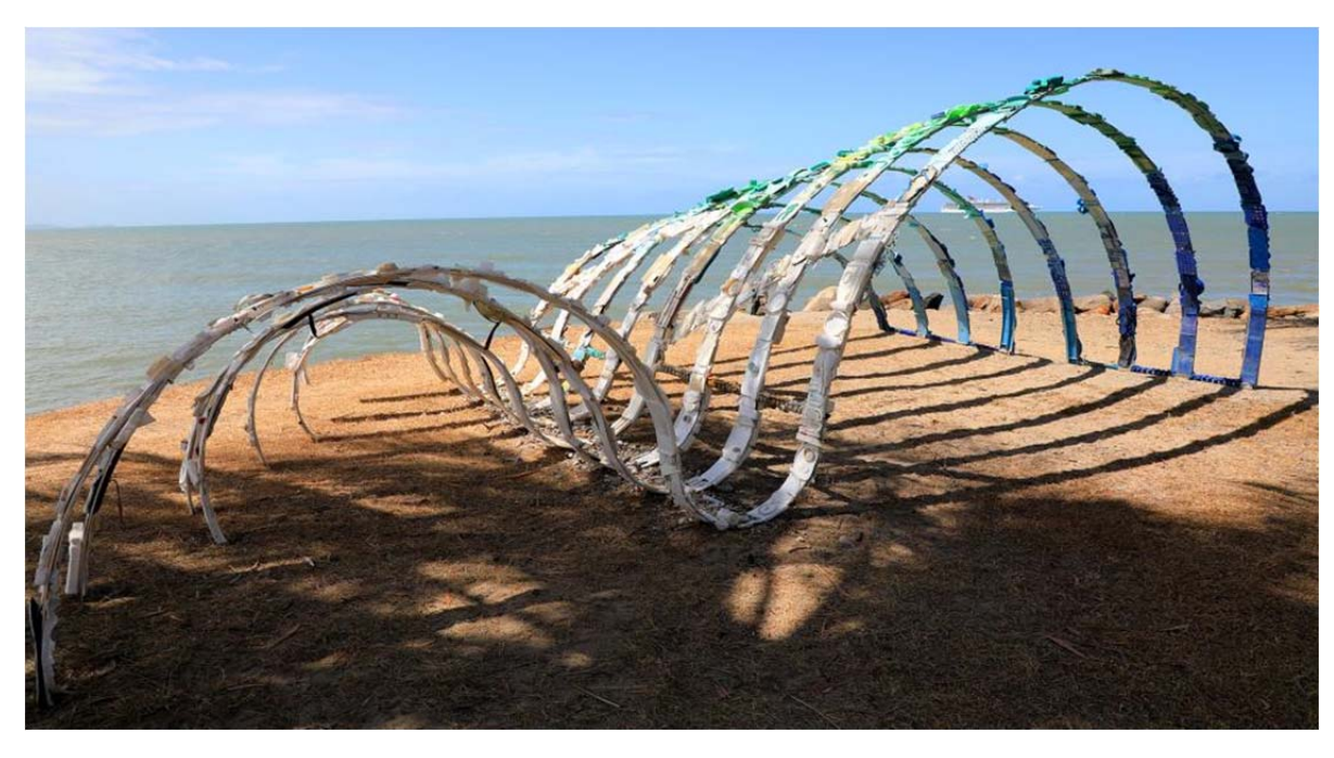
Figure 9. New Wave 7m \times 2.8m \times 3.6m Marine Debris on armature (2019). The work both indicates a wave and the skeletons of large marine animals. (Source: Jill Chism).

The last possibility is that the artist is given full control either by a self-created event or through the rarely received creative fellowship. Recently, in 2017, I created Call of the Running Tide, an Environmental Sculpture and Multimedia event which culminated in a 10-day festival in the Douglas Shire in September 2019. The event involved four venues, 28 artists and over 150 performers. As a lauded event in a region that encompasses world heritage listed rainforest and close access to the Great Barrier Reef it evidenced public recognition of the need for art events that highlight current local and global environmental issues. This event has set the precedent for a biennial 'Call of the Running Tide' festival, with the next festival in September 2021. Figure 9 below shows my piece.