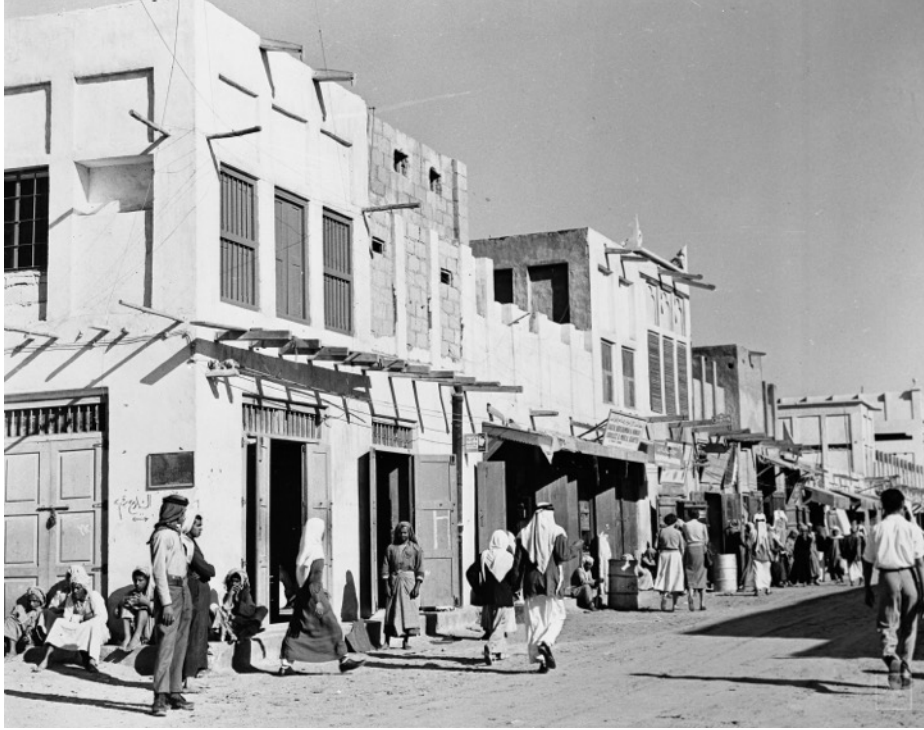
Figure 4. King Khalid street in 1954 showing architectural language still rooted in its traditional past