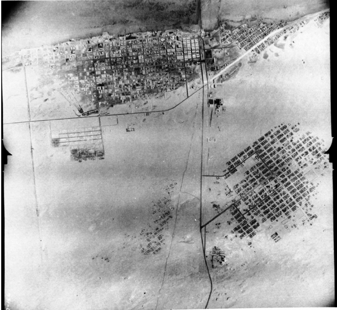
Figure 2. Aerial photograph of Khobar in 1962 showing Dhahran arterial road connecting the pier (top of the picture) to Dhahran, with squatter settlements on both of its sides.

The pressure of rapid urbanization and population influx prompted local government of the eastern province to enlist the help of Aramco to produce the first overall plan of Khobar. Aramco's involvement as a development agent was stipulated in the 1933 concession agreement, which required the Aramco to "carry out public works development." Aramco, however, avoided engaging in activities with no direct connection to profit, which the company perceived extraneous to its core business (Vitalis, 2007).