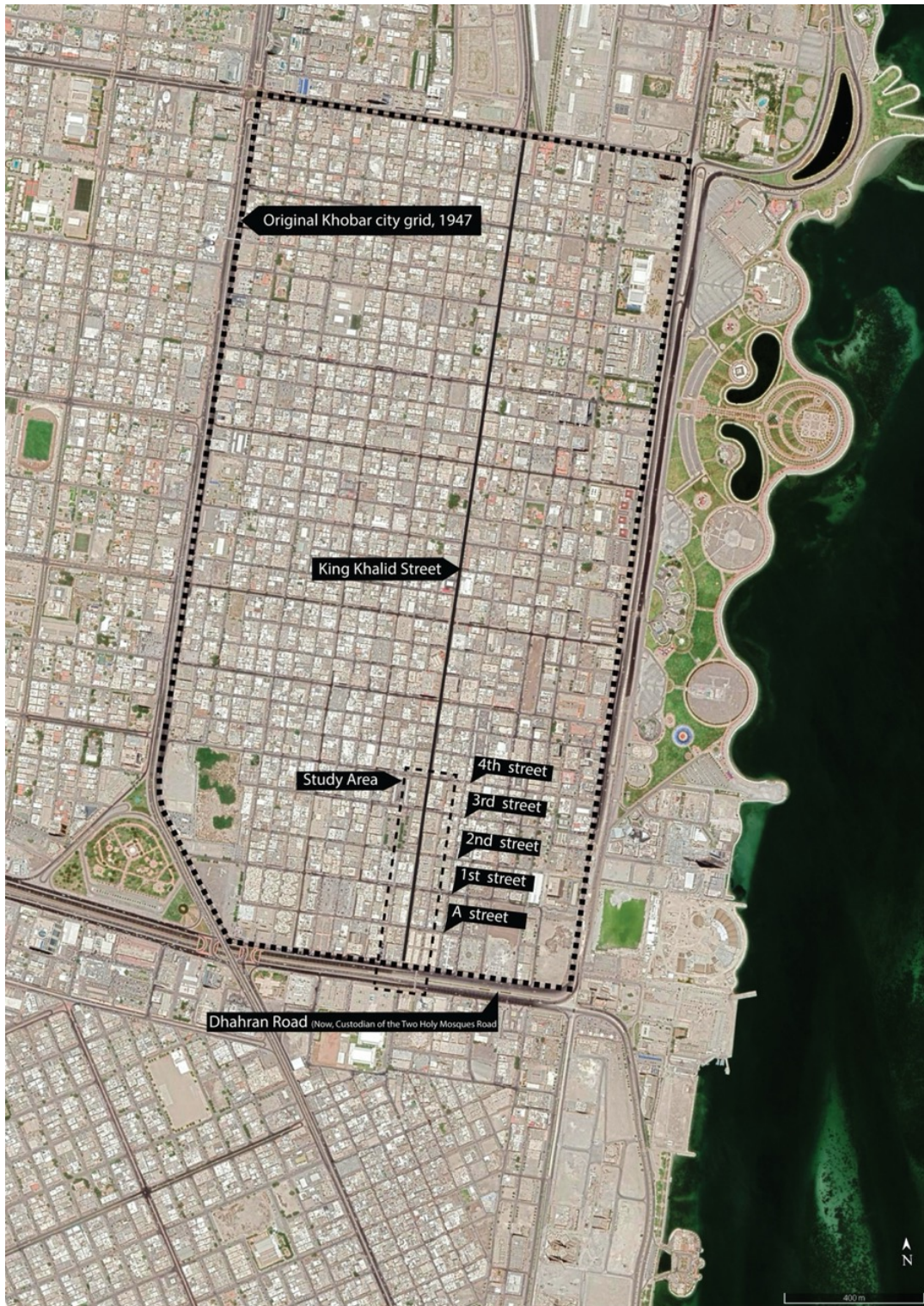
Figure 6. Study area along King Khalid street, within the original Khobar city grid of 1947 including intersections from 'Street A' to '4th street'