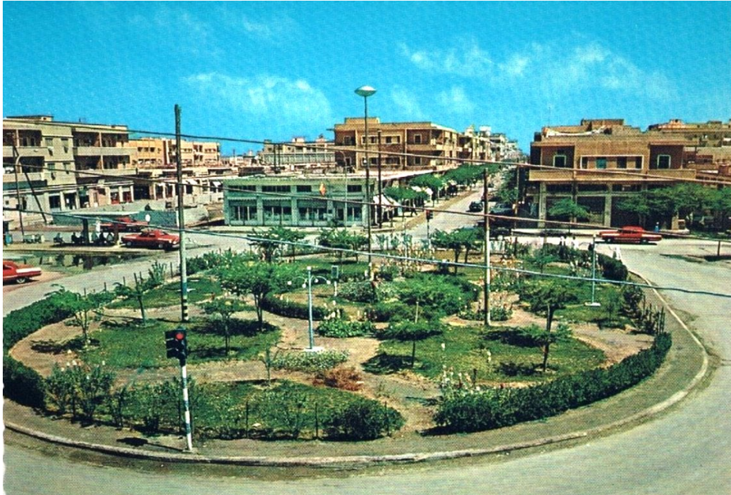
Figure 7. Postcard of a green roundabout at the intersection of the tree-lined King Khalid street (background) with Dhahran arterial road (foreground) circa 1968

There has been an attempt by Khobar Municipality to refurbish the area using new paving in 2010 (Farran, 2019). However, that was only a cosmetic treatment which could not alone create positive change (figure 8). It may have also differentiated between some of the buildings (deteriorating) and the public realm (renewed) which results in a fragmented street. Today almost ten years after the refurbishment initiative the street is suffering from economic regression, with a high percentage of vacant retail spaces and shop fronts with signs for rent. On a tactical level, this intersection was paved with interlock concrete tiles in varying colours, on both street and footpath surfaces. This effort is a cost-effective way to mimic cobbled streets. It resembles the global trend of ‘shared streets’ where the surface is shared amongst all users, including pedestrians, cyclists, and vehicles. This trend aims to equalize the hierarchy of the street by not giving priority to vehicle-drivers as it is currently the case in the neighbourhood and the region.