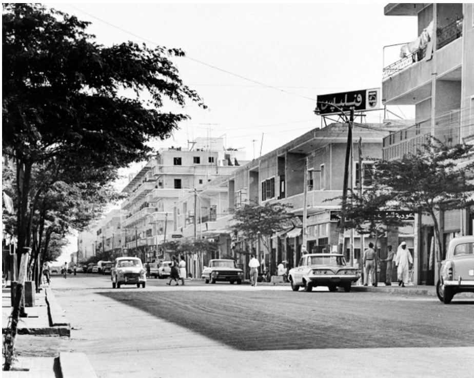
Figure 5. King Khalid Street in the 1960s with new architectural forms and building materials.