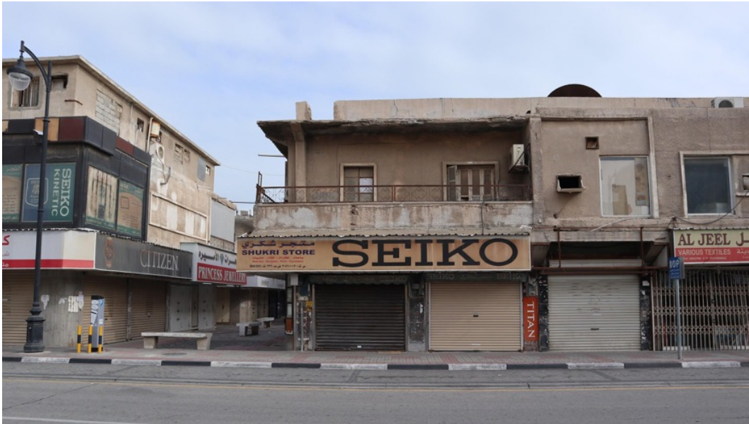
Figure 10. Kaki buildings today are in a deteriorated condition, similar to the condition of many of the past urban icons of King Khalid street, (Source: Author)

This section will discuss revitalization in the local context within Khobar, the differences between revitalization and gentrification, and then will look at the pros and cons of some methods and examples where this has been done in the past.