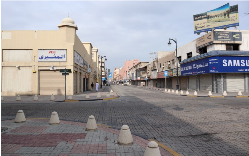
Figure 8. Refurbishment of King Khalid street. Photo taken in 2019

The Makkah-based merchant brothers Siraj and Sadaka Kaki acquired the land in an auction in the 1950s, and then started the first factory of cement blocks in the city of Khobar in 1954 to construct their new buildings. The buildings were initially developed as mixed-use multi-storey buildings with predominantly retail spaces, but then expanded to include an extra residential floor. The block also includes Aldughaiter Building, another mixed-use plot developed by businessman Saud Aldugaither following the lead of Kaki family (Al-Madani, 1991).