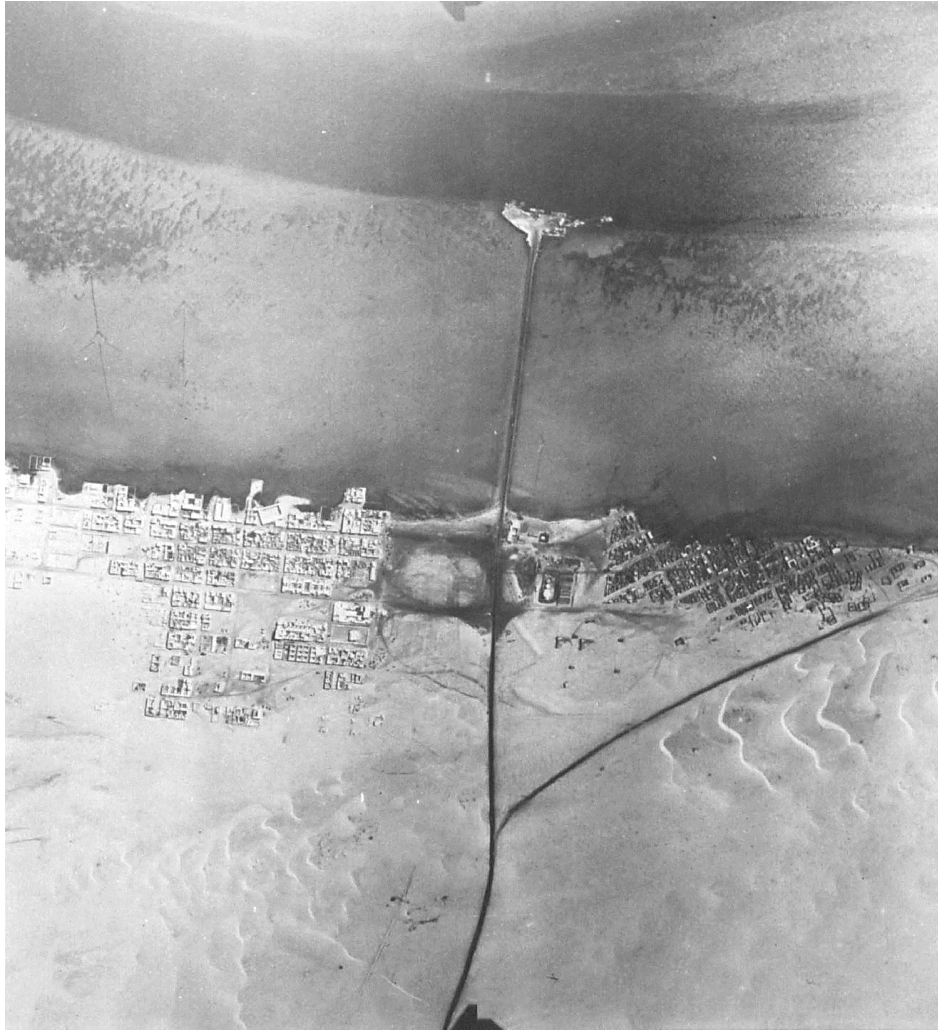
Figure 1 Khobar grid in 1951 after three years of its launch. The pier extends into the Gulf (towards the top of the photograph). Dhahran road extends from the pier towards Dhahran camp (towards the bottom of the photograph)

Urbanization of Khobar was not only triggered by the private oil enterprise, but also by public policy. In particular, the government land distribution act of 1939 was instrumental in opening the city for development. According to this act, any Saudi citizen was entitled for a land lease in Khobar awarded by the government free of charge for ten years, but to be developed within two years of receipt (Almulla, 1991, p. 286). Not only Saudi citizens were attracted by this opportunity but also residents of other Gulf countries sought to be naturalised as Saudi citizens in order to acquire land in Khobar (Ham, 1944, p. 70). As a result, internal and external population influx accelerated. In particular, settlement intensified and squatter sites mushroomed around Khobar and oil operations sites in Dhahran. The squatter settlement in Dhahran continued to exist until the mid-1980s (Parssinen & Talib, 1984, p. 14) (figure 2).