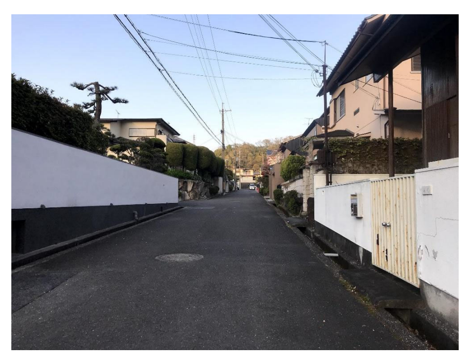
Figure 3. Hard edges in a bed town suburb in Japan.

By collecting international cases of porch placemaking, authors find that it is active in some areas and not in others. It means that several conditions help porch placemaking. One is building and neighbourhood design. When there is no porch space or equivalent, it is not easy to take action. For instance, such spaces are not available in suburban neighbourhoods developed decades ago where a hard edge surrounds individual houses. Those bed town neighbourhoods follow the modern development idea prioritizing home security, single-use, and auto transport over walking. Traditional engawa spaces die out or hide behind a wall that distinctly divides private and public realms.