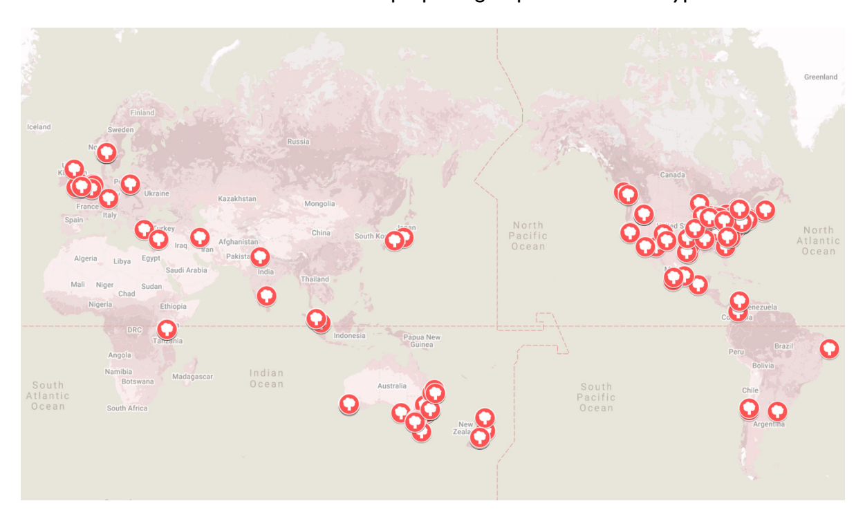
Figure 4. Projects registered in the porch placemaking week 2020.

There was no rigid criteria or requirement for registering a project as porch placemaking. Instead of defining the concept distinctly, this campaign explored various ways to apply porch placemaking by cultural and design contexts of different countries and neighbourhoods through crowdsourced actions. Eventually, registered interventions varied in scale, location, purpose, groups involved, and type of activities.