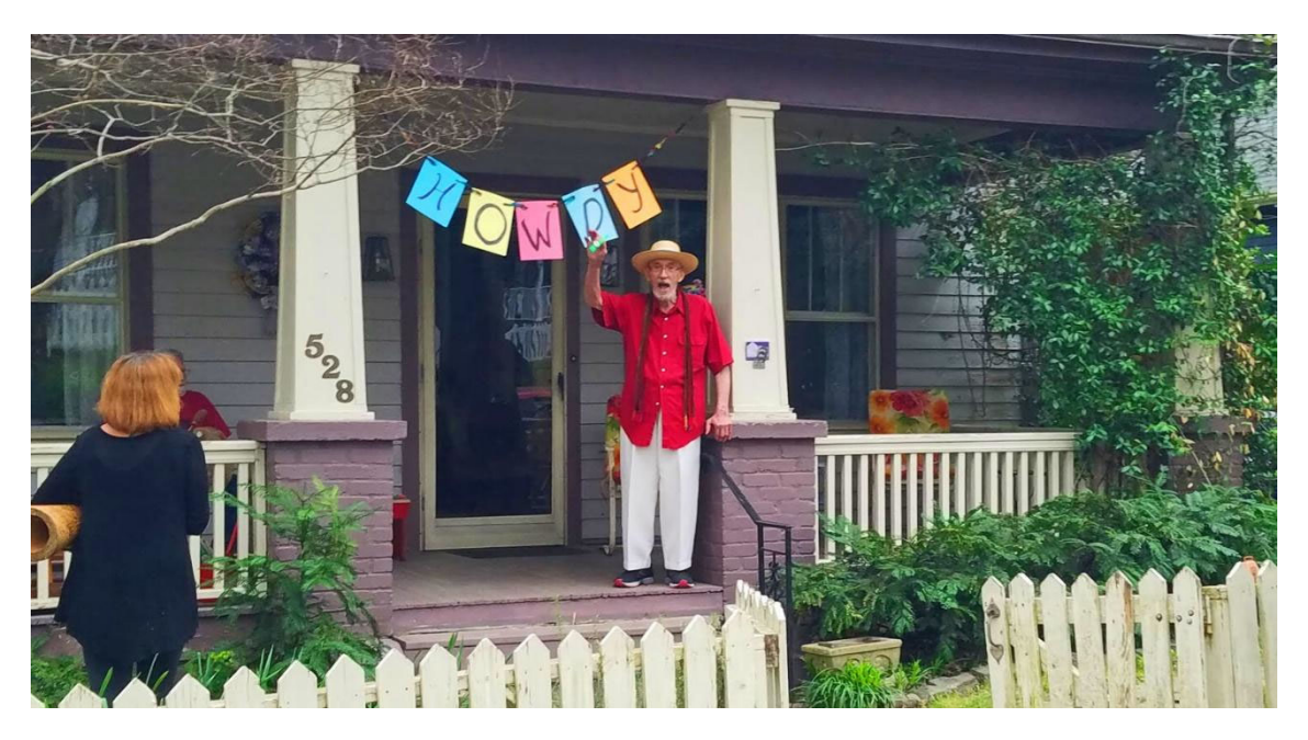
Figure 1. People are singing and making musing in the Oakwood neighbourhood, Raleigh, NC.

collaborative process in which people come together to create vital public spaces that bring health, happiness, and social connection to their communities (Project for Public Spaces, 2018).