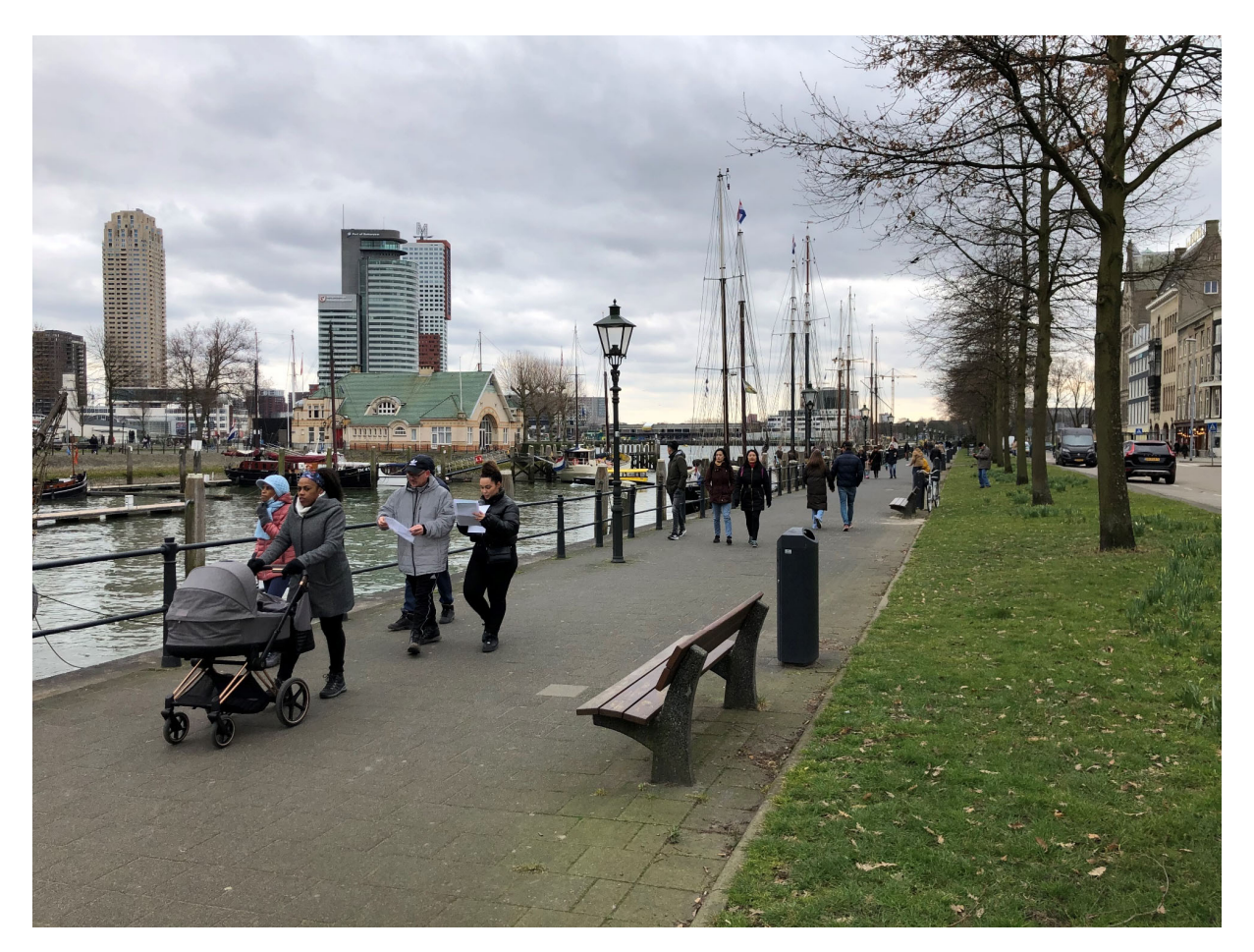
Figure 4. Different places, different people, March 2021.

"Saturday, 13th of March, 2021. We are year later. Still on-distance online almost every day. I do observe a different world. It's not unfamiliar, but from a different angle. Outside my house, neighbours have remained the dominant user group: The local public. Birds sing less loud. They may be used to the reduced noise levels in the city. Citizens' initiatives may be small but manifest. Some garden benches are added to the sidewalk of my street. Street are being cleaned and plants watered by the people living around. Acceptance, little disobedience. Only one time, most recently, when a group sat around campfire after curfew, police on bikes intervened. Having less rules in perspective again, clusters do emerge more frequent than before though. Sunny weather is a stimulus, also during chilly days. I also go to urban forests, green parks and the beaches now. I see people everywhere. New are the trendy people with a coffee-to-go in Het Park of Rotterdam, and the urbanites - gold jacket and charcoal skinny jeans - with hot chocolate and take-away waffles in the woods of Kralingse Bos. One can't avoid the increase of outdoor athletes along the river Maas, and for example scooter girls and guys with a classic urban vibe and music in Zuiderpark. All such places are popular. Yet, different places, different groups. Regardless of closed shops, even the inner-city reveals a specific public. As I concluded last year; the city is our common house."