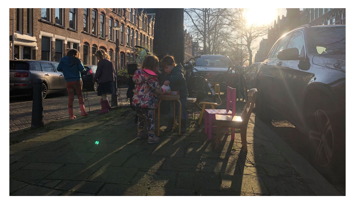
Figure 2. Domesticated Public Space, March 2020 (image by the author).