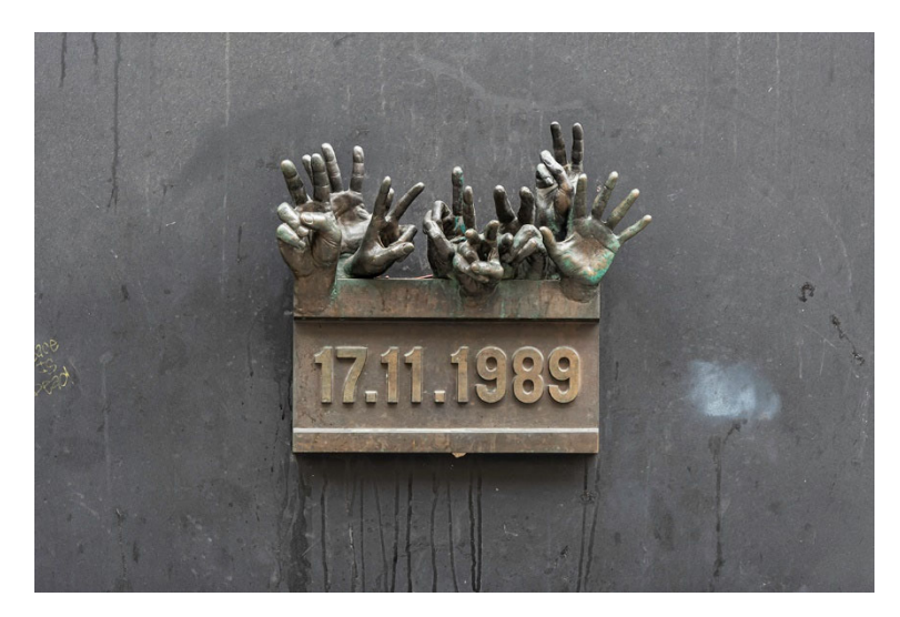
Figure 5. Artistic Acupuncture, Prague. zweintopf.

and political power. For the acupuncture mission developed in Prague, the artist duo zweintopf (Eva Pichler and Gerhard Pichler) addressed the controversial question of political statements in public space and the role of con(temporary) monuments. Public space has always been identified as the main stage for the performance of political power, and monuments and sculptures are some of its most astonishing instruments.