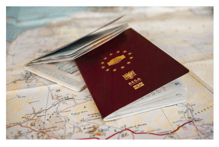
Figure 8. Artistic Acupuncture, Prishtina. Morten Traavik.

The Journal of Public Space, 5(4), 2020 | ISSN 2206-9658 | 217 City Space Architecture / UN-Habitat