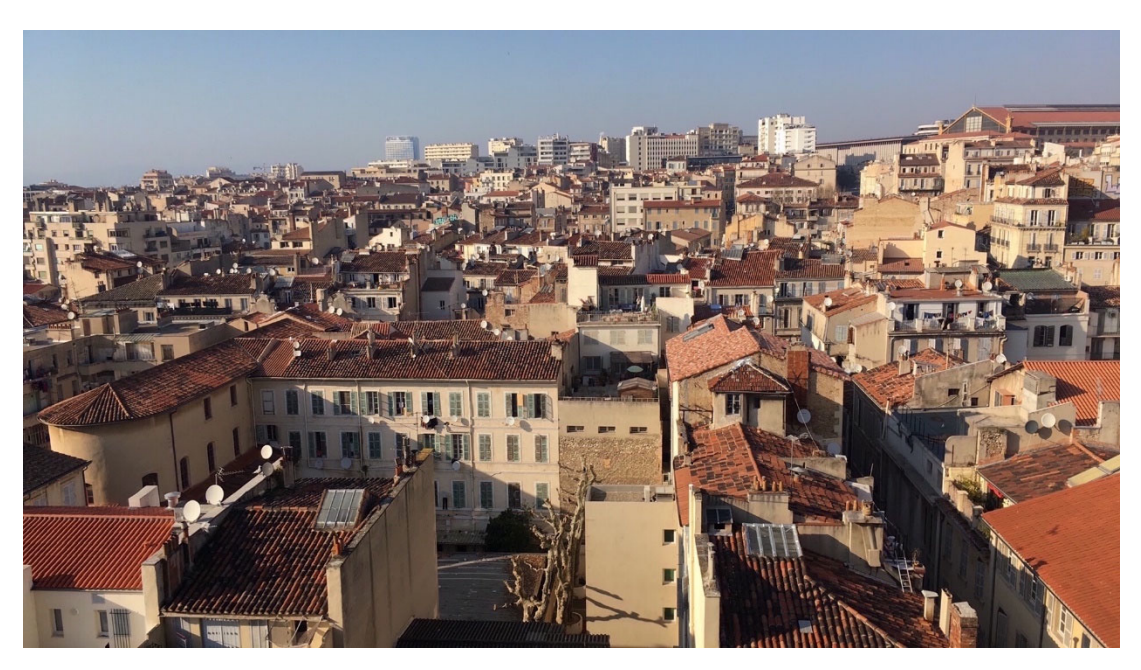
Figure 6. Artistic Acupuncture, Marseille. Maria Sideri.

As previously analysed, public spaces have a fundamental role in the accomplishment of human rights and equality, but unfortunately, beyond the positive will and statements, we also know that many public spaces are the embodiment of the lack of justice, of fear and anxiety. With that in mind, the artist Maria Sideri developed her acupuncture project focusing on the place of women in public space in the city of Marseille.