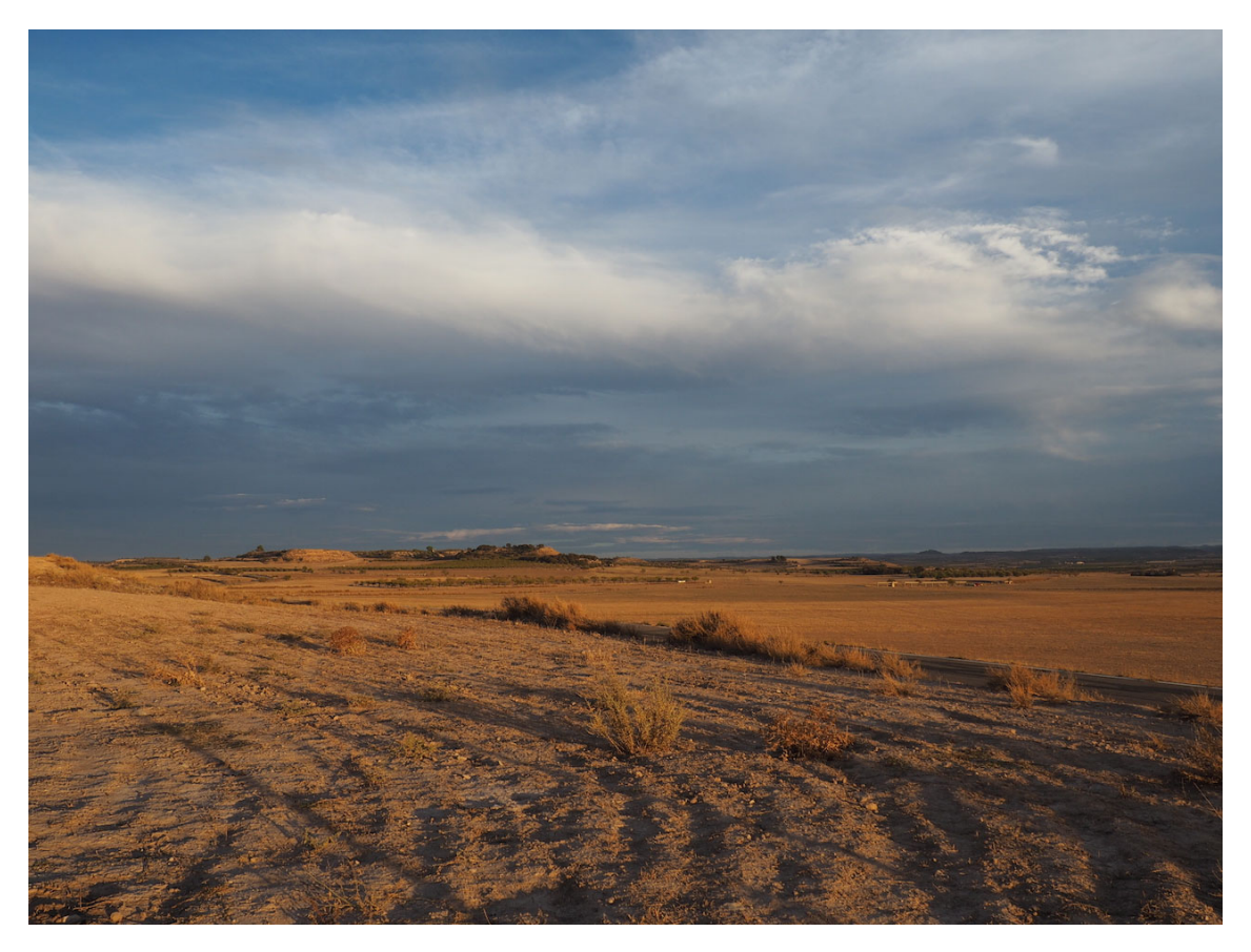
Figure 4. Artistic Acupuncture, Tàrrega. Deirdre Griffin.

It is time to claim the right to rural public space for a sustainable future, and it is important to consider the emergence of rural space beyond the simplistic discourse of contrast between centres and peripheries. Fostering urban-rural linkages; questioning models of production, distribution and consumption; reclaiming a new space for ecology and for environmental consciousness; and preserving the cultural spaces in rural areas, are some of the urgent matters to take into account related to this field. As demonstrated by the acupuncture mission of Deirdre Griffin in Tàrrega and its surrounding depopulated area, behind a curtain of distance, abandonment and depopulation, the rural areas unfold a deep wealth of knowledge, experience and values that need to be preserved.