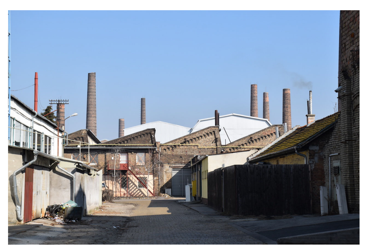
Figure 2. Artistic Acupuncture, Budapest – Csepel. Nada Gambier & Mark Etchells.