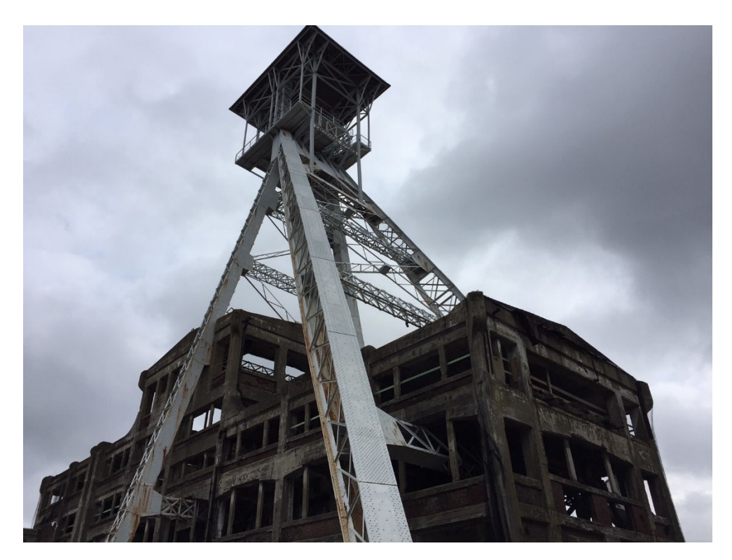
Figure 7. Artistic Acupuncture, Genk. Francesca Grilli.

Linked to the previous point, we can find different artistic approaches that emphasize how the public environment is a space of rights and duties and a space where different generations and communities co-exist in contemporary intercultural society.