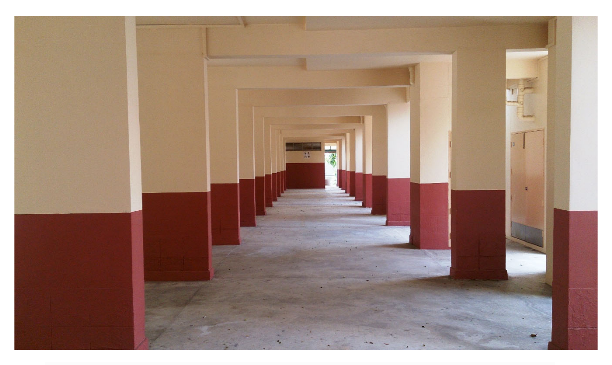
Figure 2. Project Manhatten The void deck of a block of Housing and Development Board (HDB) flats, 2014.