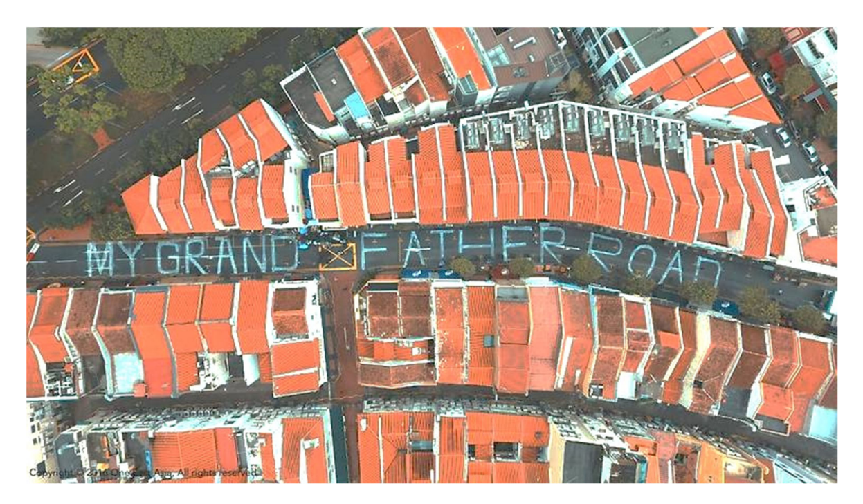
Figure 5. Samantha Lo, My Grandfather Road, Circular Road for Circular Spectacular, 2016.

Whilst most Singaporean street artists maintain legal activity, there have been artists such as SKLO or Samantha Lo, commonly referred to as Sticker Lady who have transgressed the legal limits of creative expression in public space.