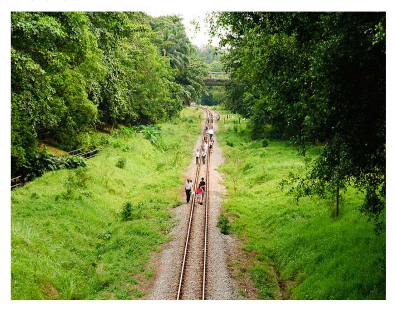
Figure 9. A view of walking group along the railway tracks from an overhead bridge near Blk 10, Ghim Moh Road, 2011.

Palay was charged and convicted under the Public Order Act, revealing how his performance art piece confronted the boundaries of citizen activity in the public realm and the streets as a place to enact authority. In this temporal intervention, Palay contested control over the public realm, revealing that the city and urban space is not neutral. The appropriation of public space for performance art engaged critically with hegemonic structures and highlighted how artists open discourses that embrace multiple perspectives.