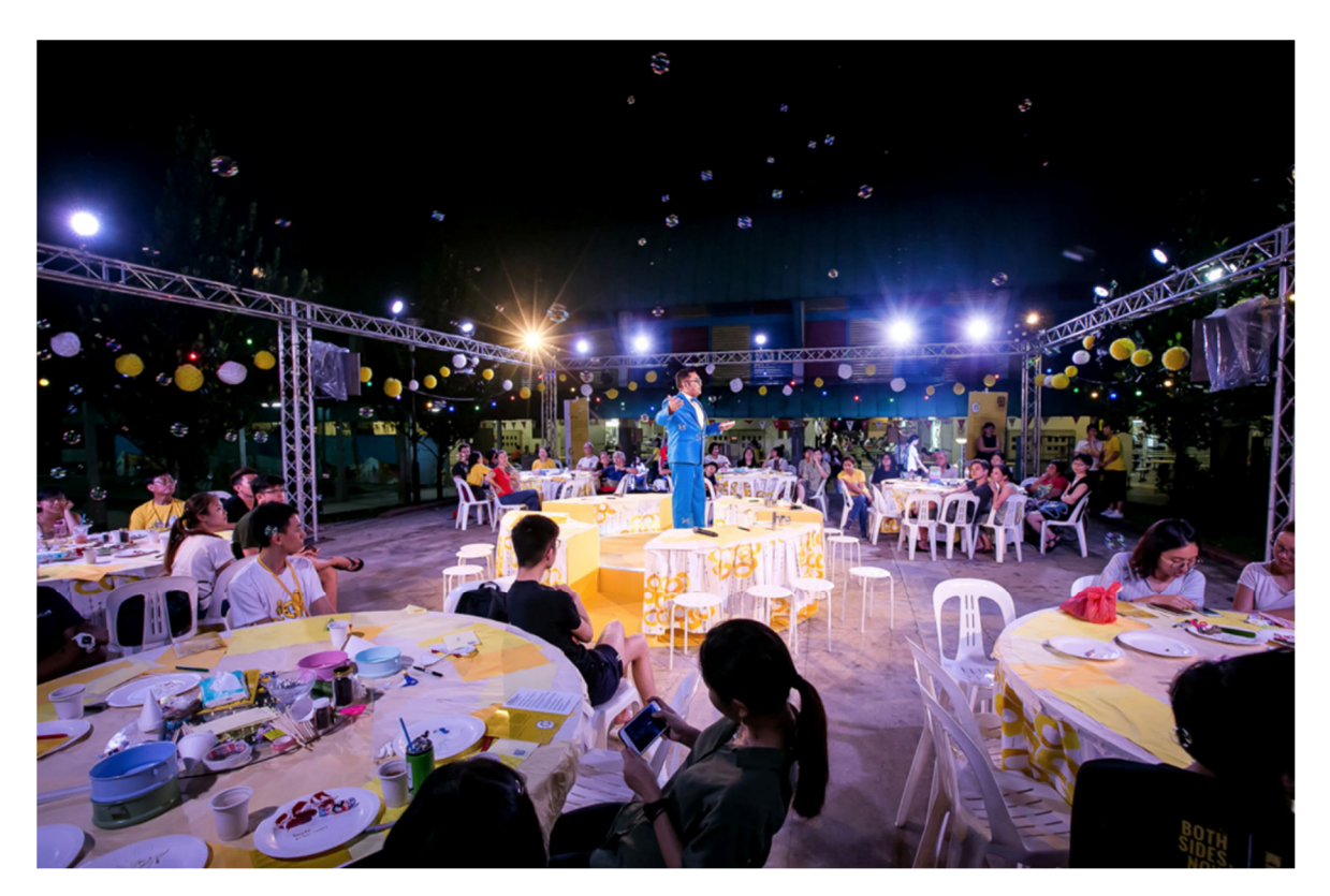
Figure 11. Drama Box Last Dance, Participatory Performance Telok Blangah, 2018.