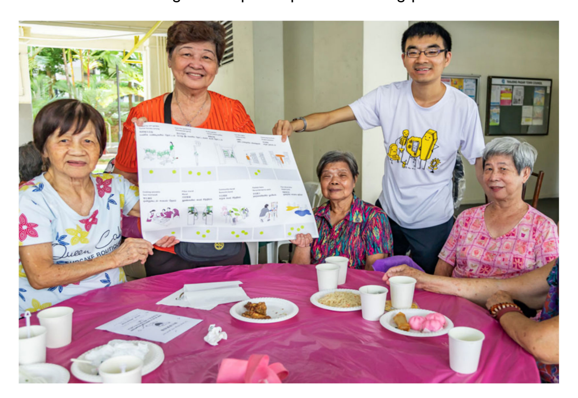
Figure 10. Drama Box Both Sides Now, Hello Parties at Telok Blangah, 2019.

Through engaging HDB residents in their homes and in the public spaces of the void deck, artists are finding ways to more fully engage the public in their immediate environment and participate in activities that also give them a voice to share their experiences and concerns. This work continues, and builds upon the tradition of informal activities occurring in these public spaces across Singapore.