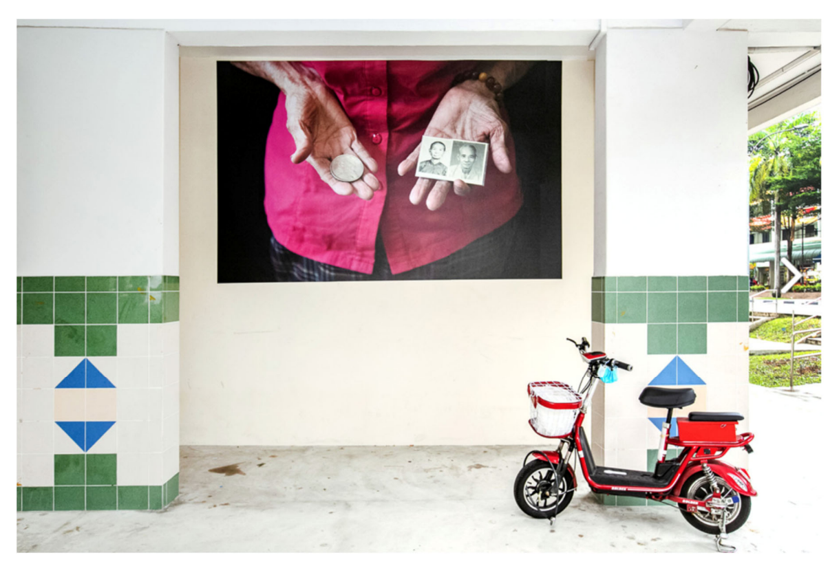
Figure 12. Drama Box, Closer - Public Art Installation, 19 September - 6 October 2018 at Chong Pang.