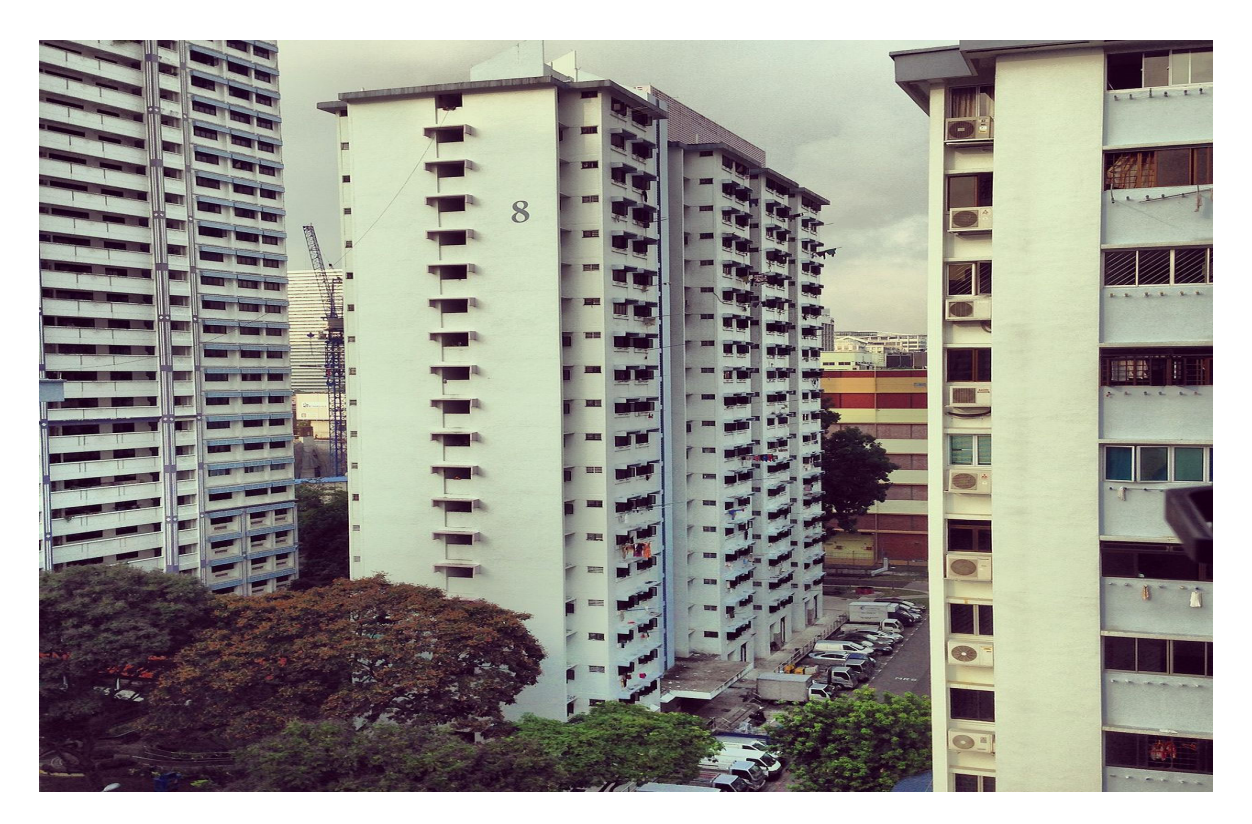
Figure 1. Martin Pasquier, A view of Housing and Development Board (HDB) flats in Lavender, Singapore, seen from Block 805, King George's Avenue, 2014.