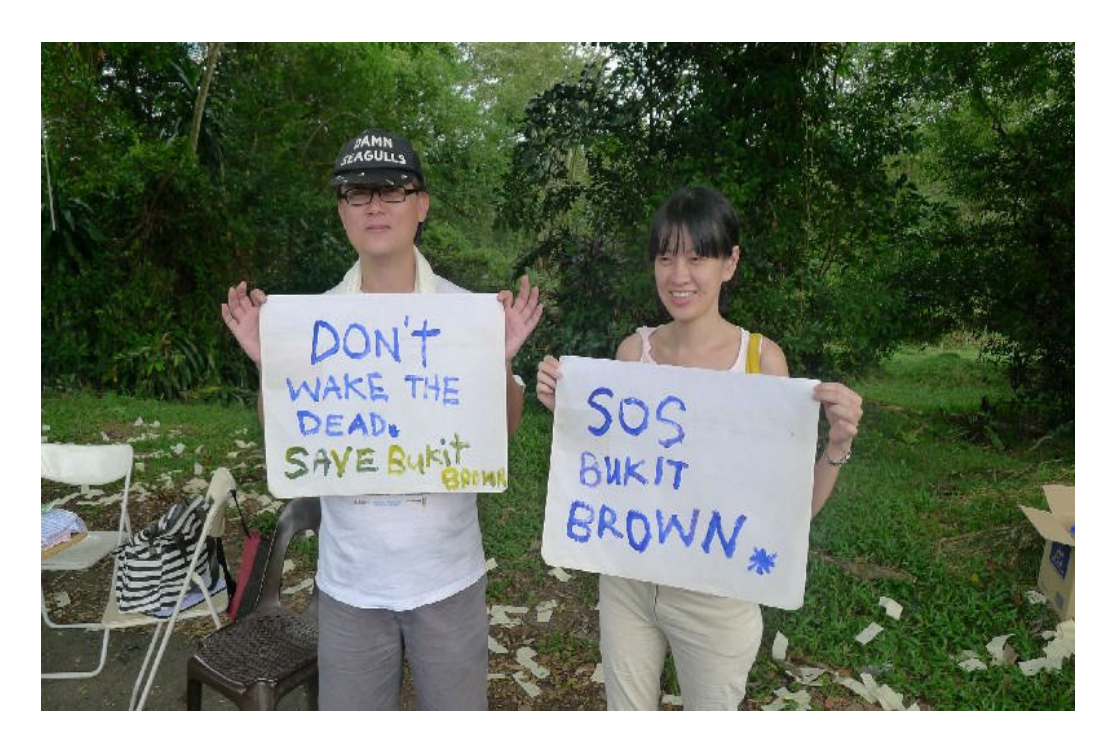
Figure 14. Citizens protesting as part of SOS Bukit Brown, Singapore

The case studies and projects described in this essay demonstrate the possibilities for a community of practitioners working across different mediums and disciplines, yet united by the common purpose of expanding notions of public space through artworks that are alternately activating, controversial and provocative, and delight and engage. Many art works offer new, exciting ways for connecting citizens, diverse communities and publics in activities that forge meaningful identity and belonging. Art in the public realm can create opportunities for forging conversations around spatial justice and highlight the value and benefits of genuine public space for citizens. The process of access, collaboration and engagement through artwork, and art activities in the public realm has created new pathways for the public to engage in positive acts of citizenship. In creating dissensus, the artists identified in this essay have an important role to play in expanding public spaces in the urban environment.