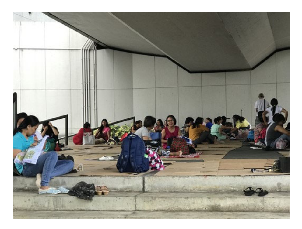
Figure 3. Unofficial public spaces accommodate many activities, such as pre-pandemic weekend social gatherings in Hong Kong.

As cities look to the future, planners can strive to identify informal spaces, inventory them as municipal and national assets, and include them in the city's land use plans. Observing and engaging with the public in the places where they spend their daily lives would allow planners to better understand citizens' values and preferences. As the old adage goes, "We measure what we care about." Land use planning benefits from placing informal public spaces into dialogue with typologies of parks, park connectors, and greenery. Traditional parks are still needed, but informal spaces bring social value to households that should not be underestimated (Teo, 1997).