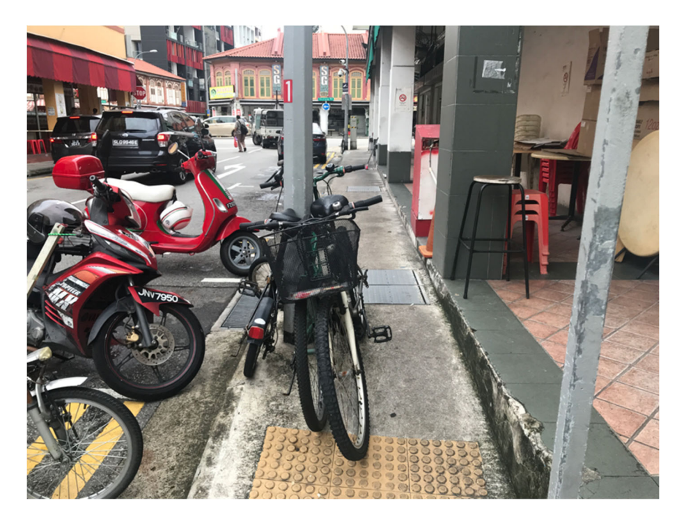
Figure 4. Keeping sidewalks accessible for pedestrians of all physical abilities, including along this lane in Geylang, Singapore, will be increasingly important.