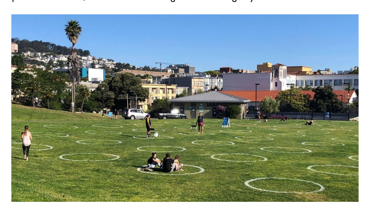
Figure 1. "Human parking spaces" in Mission Dolores Park in San Francisco, May 2020.