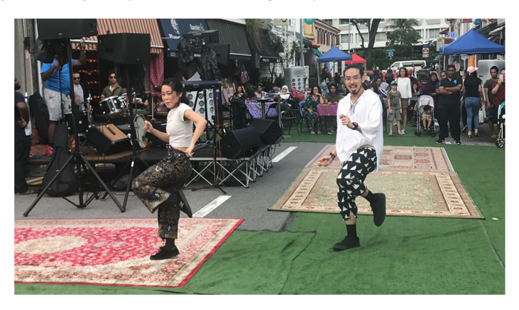
Figure 6. Streets in the Kampong Glam historic district of Singapore were closed to vehicle traffic, and the URA Place Management Department arranged for rugs, seating, live music, and performances during a community event in November 2018.

Installing more "parklets" to replace roadside parking spaces with public seating—a concept born in San Francisco that mushroomed into a global movement—and converting more roads into outdoor café seating could encourage patrons to return to retail areas ( The Guardian , 2016; The Washington Post , 2020). Giving streets back to the people during the pandemic may have initially been motivated by public health, but these efforts may be maintained if they turn out to be economically useful, and sufficiently enjoyable to the public (Hass-Klau, 1993; Lung, 2002).