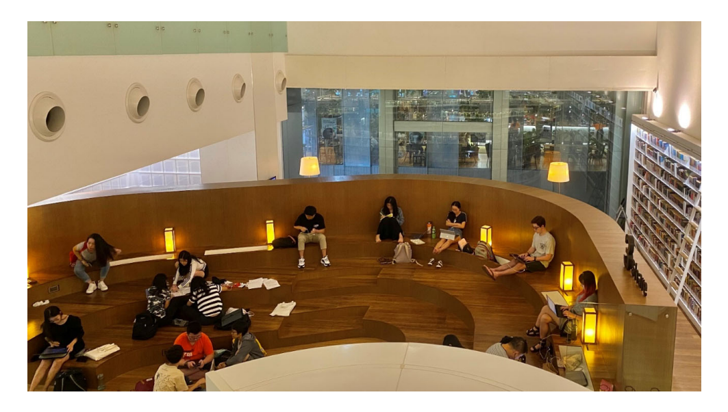
Figure 5. Libraries serve as community gathering places, and even as workplaces for enterprising freelances. Library@Orchard in Singapore.

work is likely to grow ( The Straits Times , 2020). Could similar public spaces allow freelance knowledge workers a place to congregate? In the National Library, the existing seating plans already accommodate the I-metre of physical distancing required by the government, allowing them to continue operations in the early phase of COVID-19. When pondering the future of public spaces, aside from more parks, cities can also consider building covered, air-conditioned spaces with Wi-Fi connectivity and outlets.