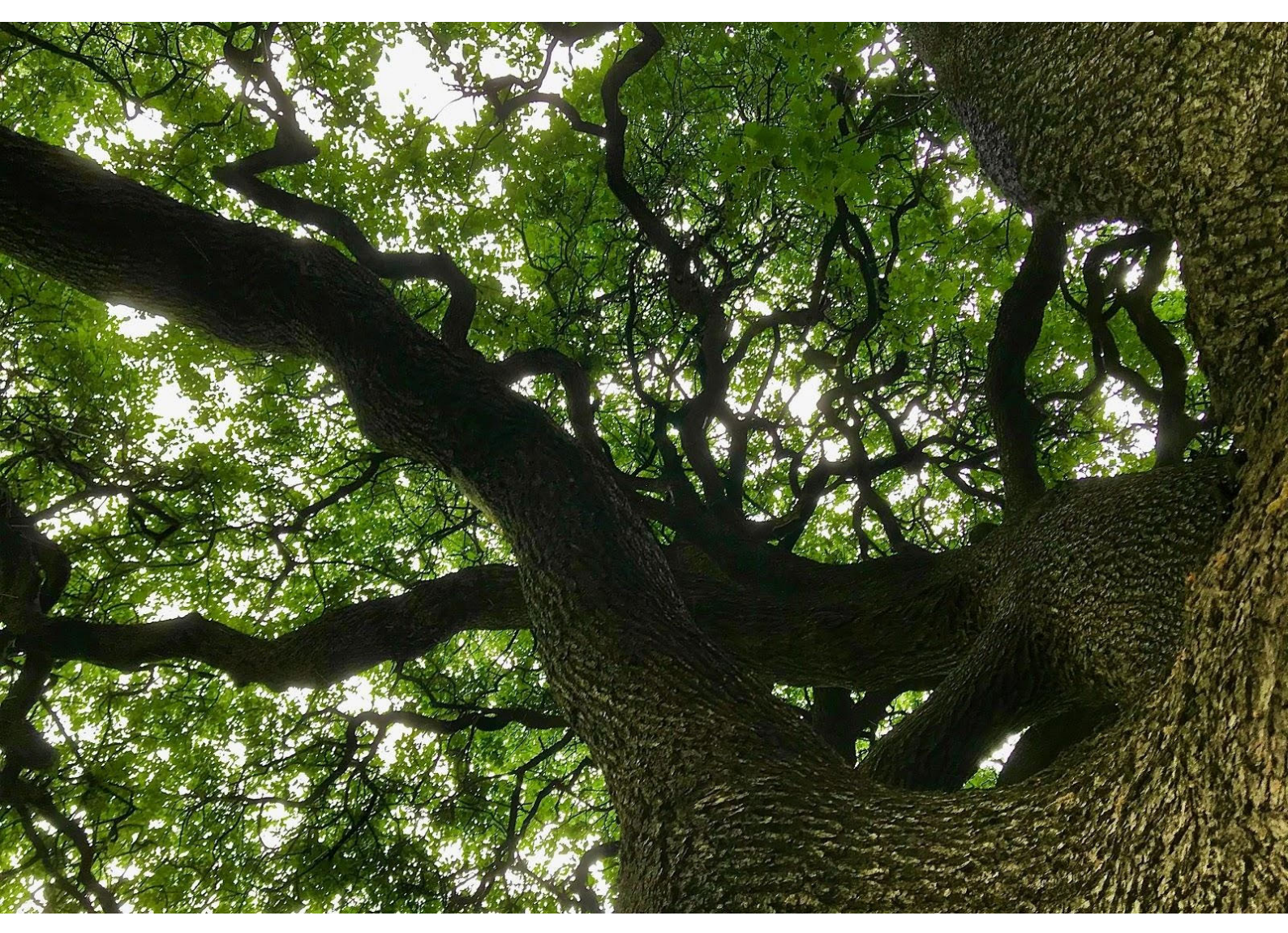
Figure 1. Arboreal canopy. 2019

Staying alive- for every species- requires liveable collaborations. Collaboration means working across difference, which leads to contamination. Without collaborations, we all die.' – Anna Tsing<sup>1</sup>.