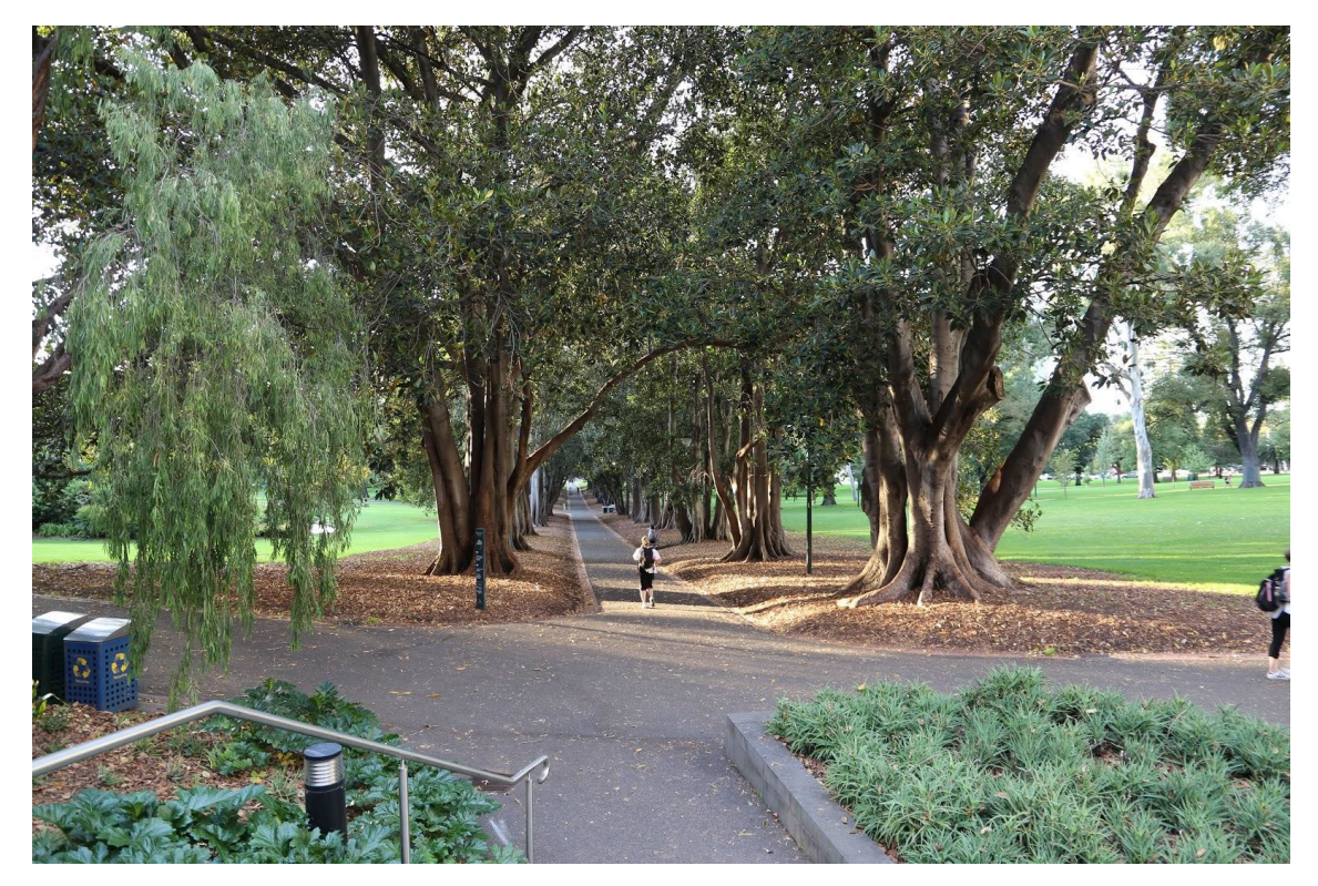
Figure 7. Moreton Bay Fig (Ficus macrophylla). Treasury Gardens 2020.

The Journal of Public Space, 5(4), 2020 | ISSN 2206-9658 | 237 City Space Architecture / UN-Habitat