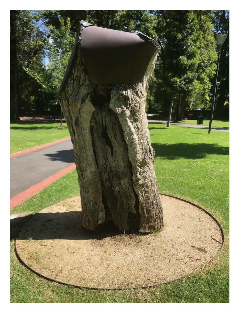
Figure 11. Indigenous Scar tree, Fitzroy Gardens. 2020.

This exemplifies a history where there has been an erasure of First Nations people by the dominant colonising culture. In this garden where numerous narratives are so clearly signposted there is cursory notation to the Indigenous, Traditional Owners of the land the Boon Wurrung (Bunurong) and Woi Wurrung (Wurundjeri) peoples of the Eastern Kulin Nation. Fitzroy Gardens exists at the cost of the removal of a whole integrated way of life. An embodied approach whereby Indigenous people lived collaboratively with rather than separately on the land.