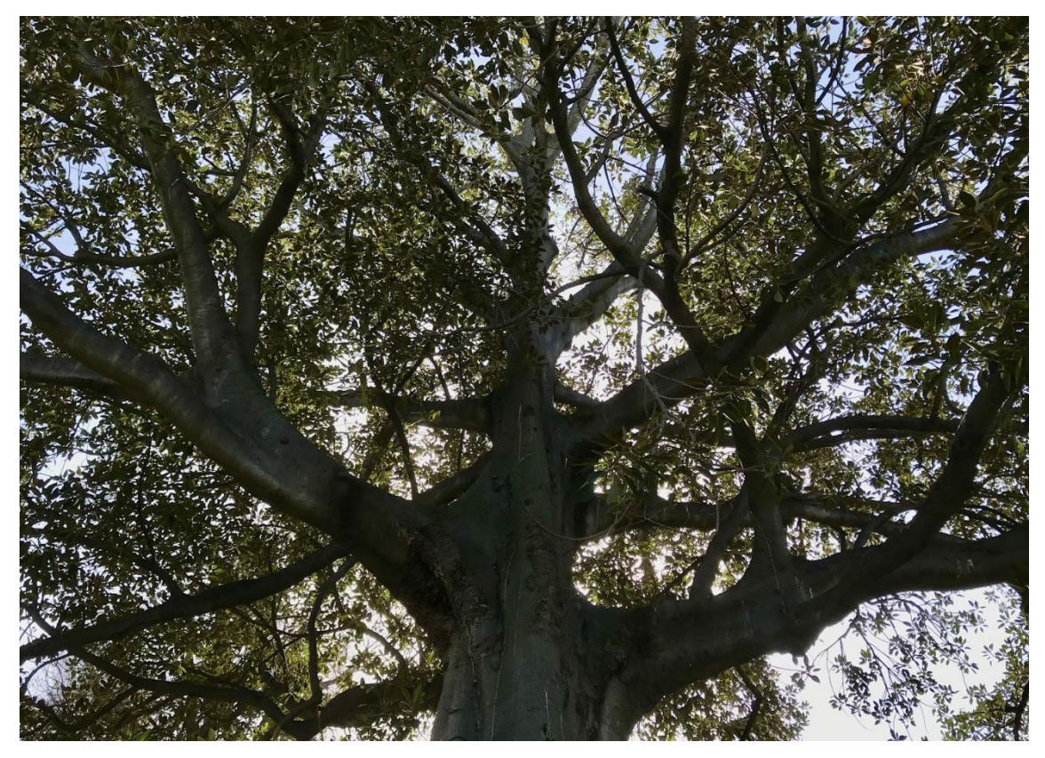
Figure 6. Moreton Bay Fig (Ficus macrophylla). Fitzroy Gardens 2020.