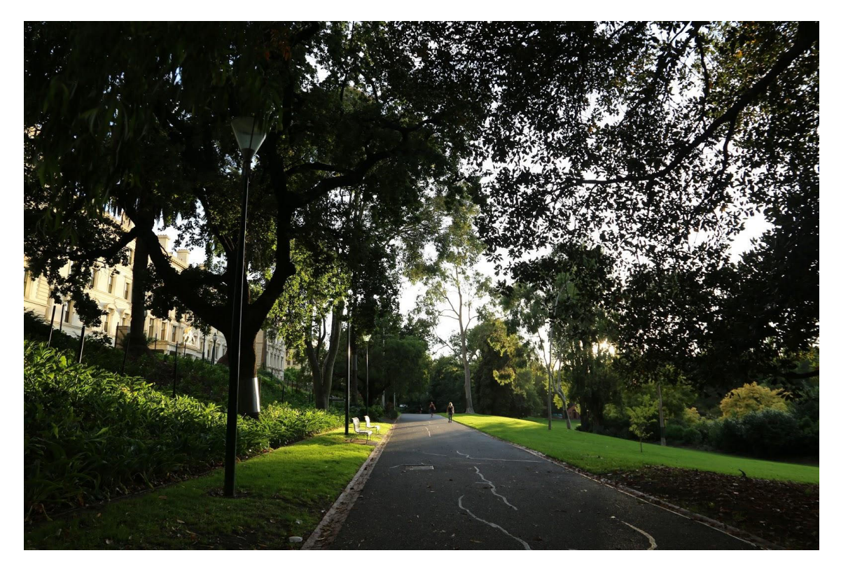
Figure 2. Walk from Treasury Gardens to Fitzroy Gardens. 2020.

Treegazing was a political form of subtle activism.