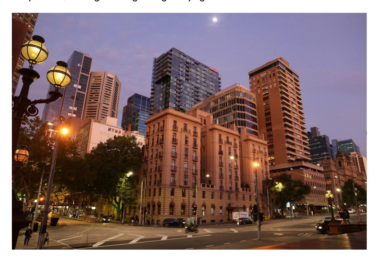
Figure 3. Melbourne. 2020.

This is a silence in action where the ego is not present. In the process of uniting with an activity we can forget the self and can become more intimate with the vividness of the present moment. We have a choice to step away from past conditioning and be fresh and alive in a moment-to-moment awareness (Rosenberg, 1998). One of the meditation practices that was employed was the Buddhist practice of Mindfulness. Mindfulness can be described as, "an open-hearted awareness of our thoughts, emotions, bodily sensations and environment in the present moment" (Bunting & Kearney, 2016). The Buddha guided that Mindfulness could be practiced in four postures, walking, standing, sitting and lying down.