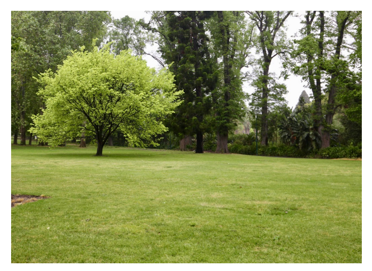
Figure 5. Golden Elm (Ulmus glabra 'Lutescens'), Fitzroy Gardens.2020.

considerations was to highlight 'plant blindness', noting how the modern society has 'devalued plants' (Mancuso 2018). To develop deeper connections and understandings, plants must be viewed as complex organisms with 'sophisticated capabilities' (Mancuso, 2018). To consider vegetal-beings we need to 'cultivate a thinking about plants, as well as with them and consequently, with and in the environment, from which they are not really separate" (Marder, 2013).