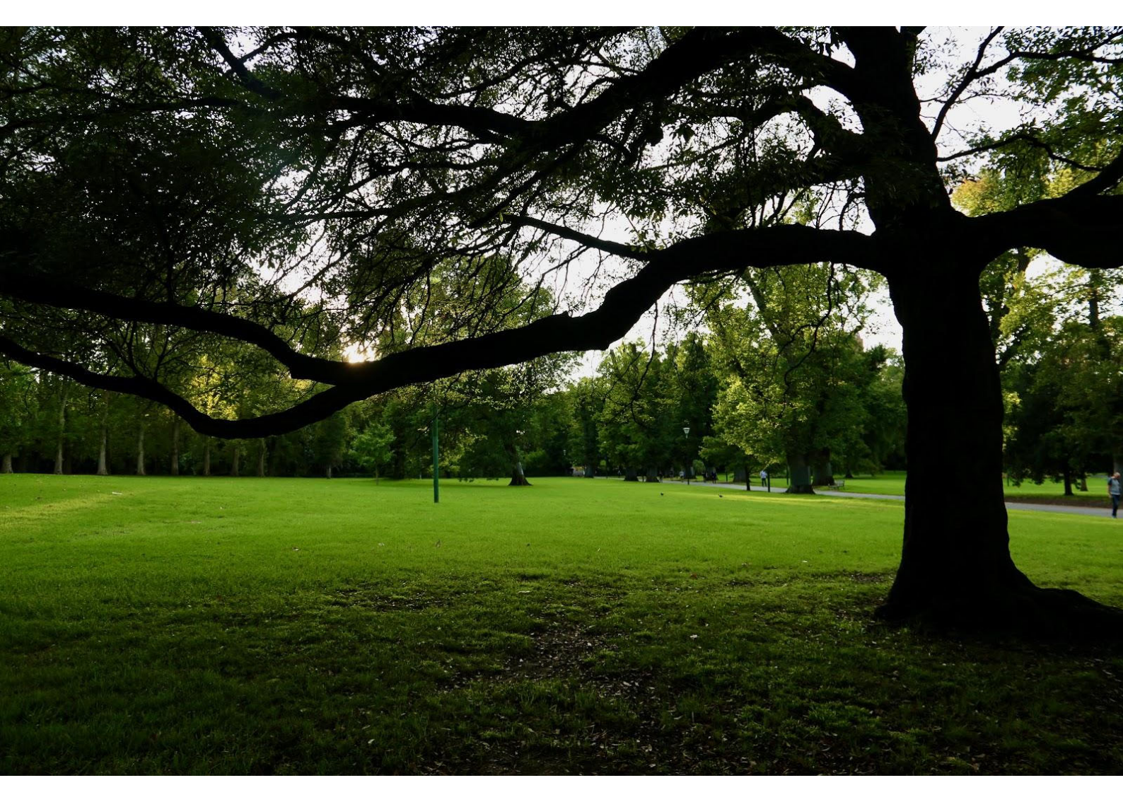
Figure 12. Fitzroy Gardens. 2020.

As a result of this project, we suggest that 'walking in a landscape' offers more than photos. The effects of nature stay with us restoring and nourishing our minds and bodies. We composted mediative, landscape design and arts practices together. Critical theories informed our collaboration. Weaving together the complexities and features of the site illuminated multiple narratives. We specifically chose the start and end of the walk, to highlight a history of colonization. As part of this walk, we were committed to acknowledging Indigenous connections to land. Treegazing was designed to: give participants a temporal space; to notice the sensations of the body; to experience and connect with vegetal-beings and to come together as a community of strangers. In this moment of time Covid-19 has caused us to live in radically different ways, whereby walking has new significances. We might reconsider how we connect with the world around us, how walking can be an act of subtle activism and how rethinking our relationships to everything might lead to more collaborative ways of 'living and dying well' (Haraway, 2016).