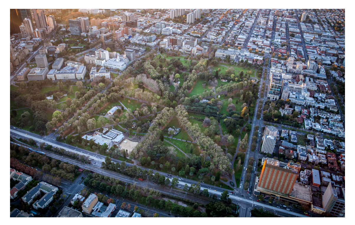
Figure 8. Aerial view of Fitzroy Gardens- Note radiating tree avenues references the Union Jack Flag.

Fitzroy Gardens exists because city planners recognised the value in establishing free public gardens and parks for health and recreation purposes. The idea that parks and gardens are beneficial to health was in the 1800's largely intuitively based. The gardens evolved over time with increased lawn areas evoking sweeping vistas in a Gardenesque style. Gardens are highly cultivated spaces whereby nature is domesticated via a hierarchy of power. Human interests are always at the forefront in the garden.