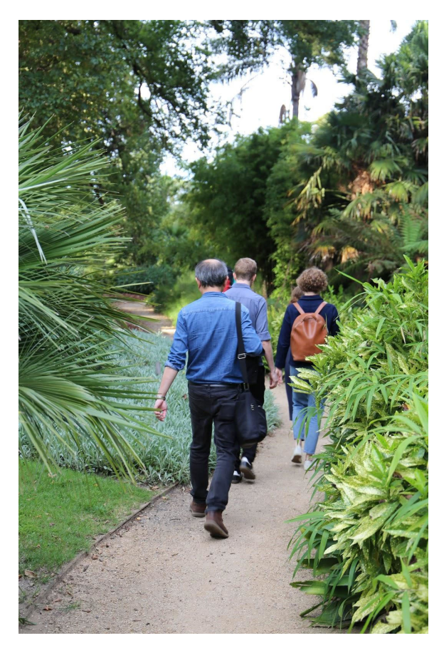
Figure 9. Treegazing walkers, Fitzroy Gardens. 2020.

Treegazing shares a political agenda, a model of generosity that aims to shift modern society from 'consumption to contribution'(Sheldon,2019). The transition from the 'selfish', a form of 'greed economy'(Sheldon,2019) to a community that has enough. To promote more holistic thinking and actions towards nature and confront colonial and capitalist desires of our urbanised existence (Myers, 2018).