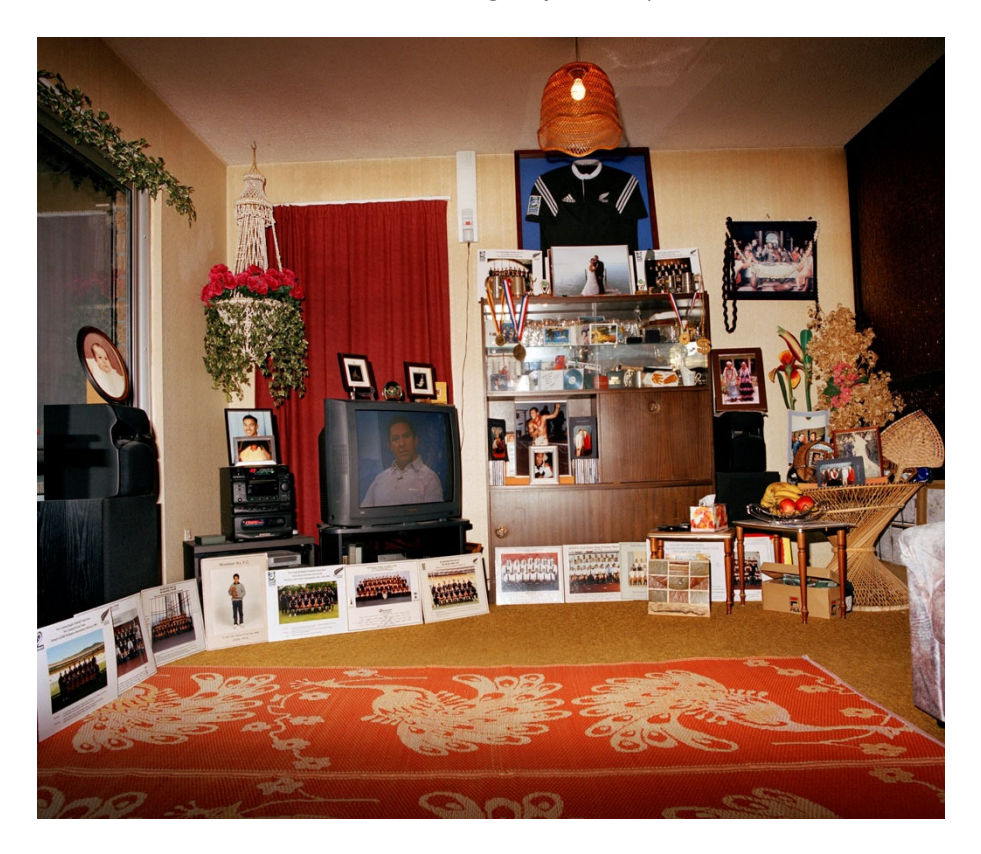
Figure 2. House of Tiatia, 2007.