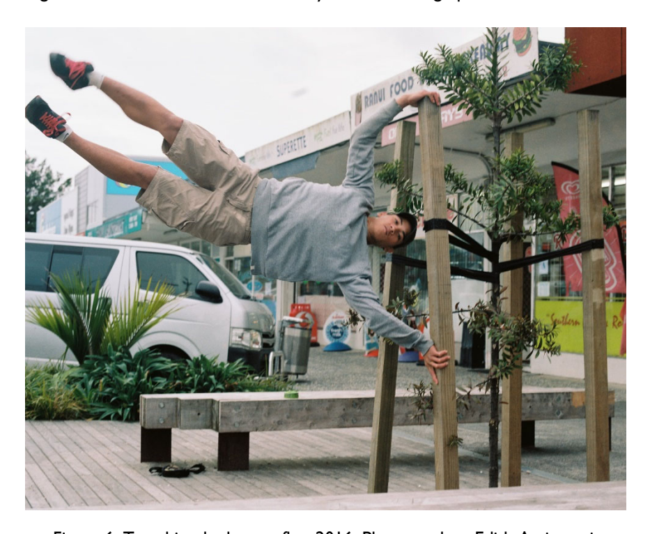
Figure 6. Tups hits the human flag, 2016.