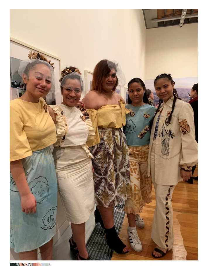
Figure 15. Victoria and Massey University fashion students respond to Double Take, closing event, Adam Art Gallery, 2019.