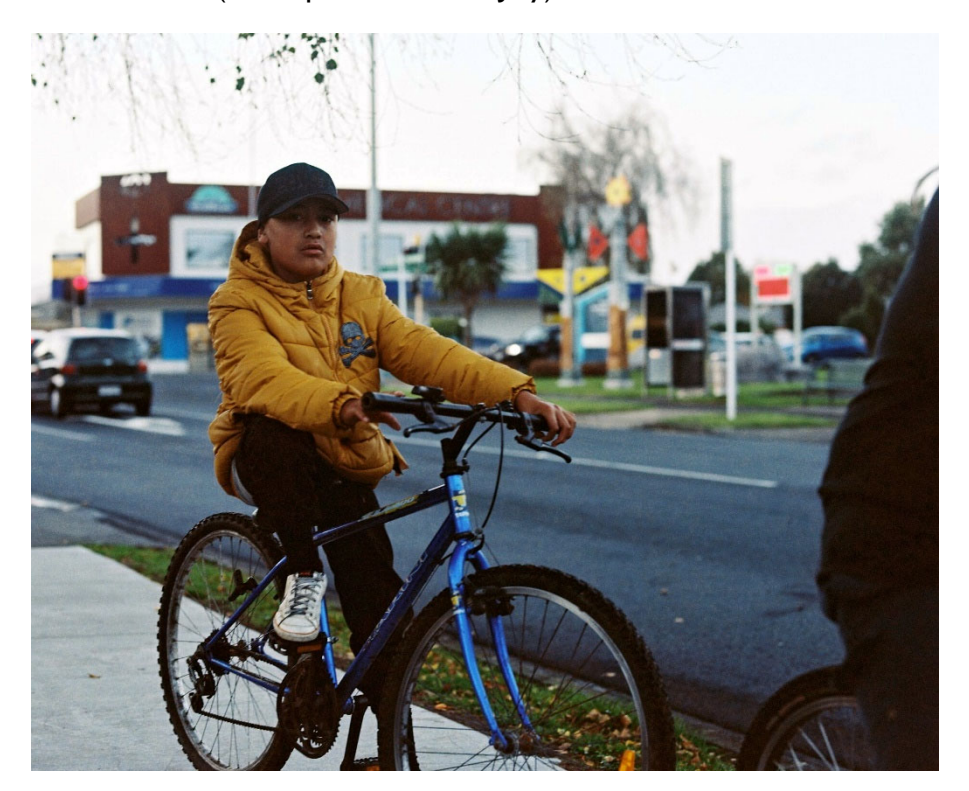
Figure 7. Treynar, 2017.

These immediate images taken as a response to Amituanai's observations of the subject convey the sovereign identity of the individual as they desire. Some kids are snapped as they exceed codes of conventional public behaviour such as in Tups hits the human flag , 2016. Every photo is responsive to the subject; for Amituanai 'every picture needs to be based in 'a connection' (2020, pers. comm. 3 July).