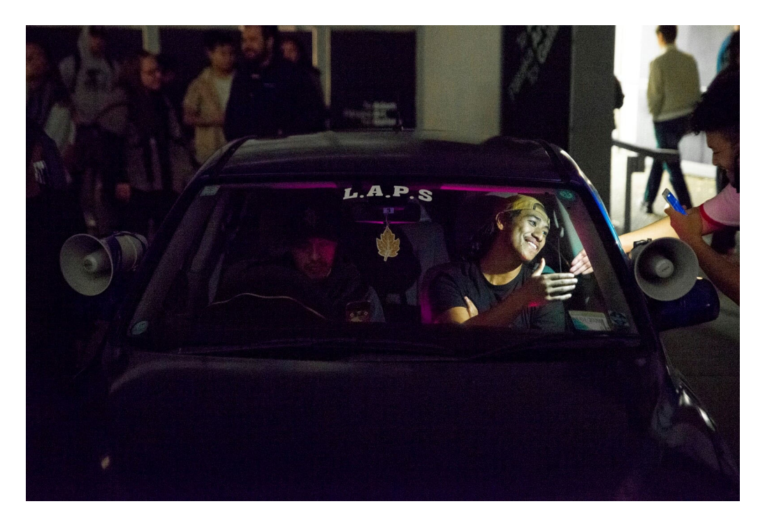
Figure 17. Siren cars, Double Take opening, Adam Art Gallery, 2019.