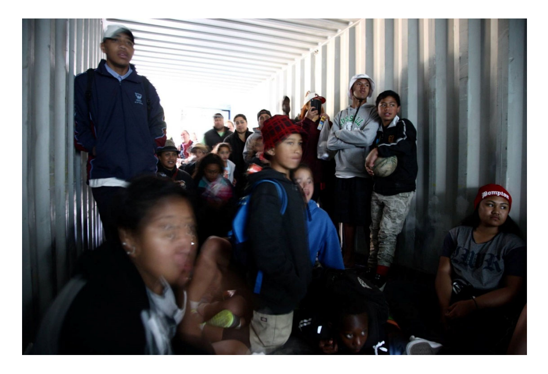
Figure 9. Watching the Ranui 135 video in the container.