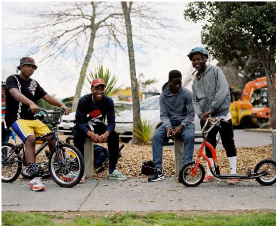
Figure 3 (left). Girls outside the library, 2016. Photographer: Edith Amituanai. Figure 4 (right). Pasifique and friends get bikes, 2015. Photographer: Edith Amituanai.

Since 2015 Amtuanai has developed Edith's Talent Agency ETA , an ongoing photographic series of young people snapped performing their lives in public space. Amituanai has been an interloper into the domains of youth where she has established their trust through the proximity of living and working as arts coordinator in the neighbourhood and showing her credentials as an art photographer. The ETA images show gatherings in parks, shopping centres and in the street where young people are actively creating their own worlds. I would argue that these images of single subjects or small groups gaining visibility in ETA support the argument by Anna Hickey-Moody (2013, 19) that youth can perform or enact important forms of citizenship through being recognised as 'little publics'. Space is often occupied in a gendered way as in the bodies of the Girls outside the library , 2016 or Girls at Starling , 2017. The ownership of a bike enables the ebb and