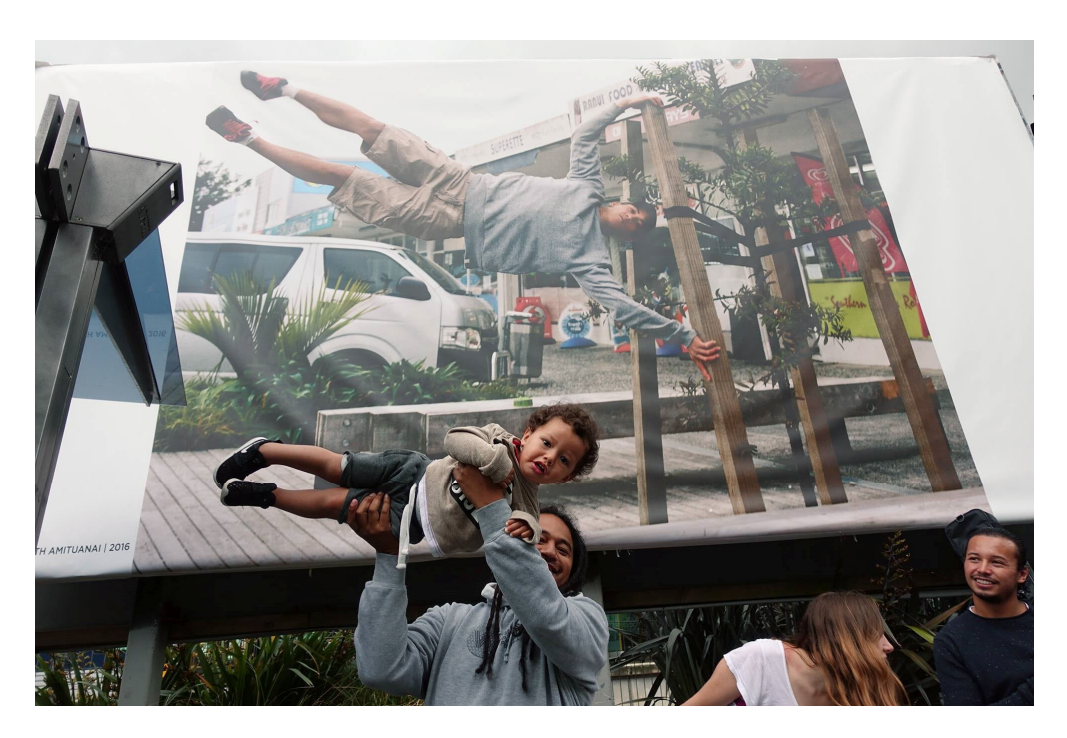
Figure 12. Father and child with Amituanai billboard, Tups hits the human flag, 2017, part of Urbaneisa, 2017.