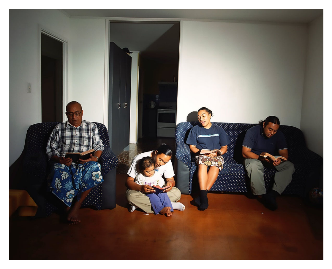
Figure 1. The Amituanai Family Lotu, 2005.