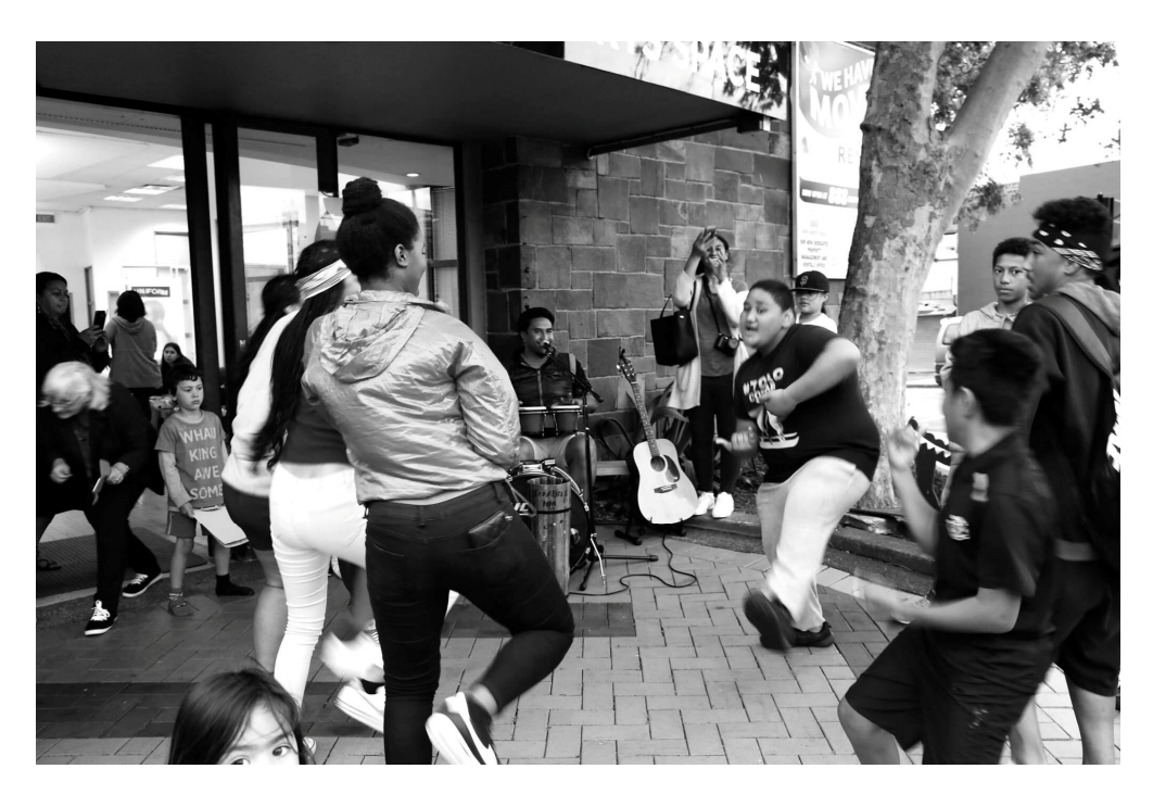
Figure 11. Street dance, Urbaneisa opening, 2017.