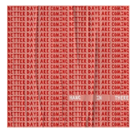
#2 / Innovative Approaches and Creative Practices in Response to the COVID-19 Pandemic