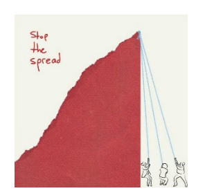
#1 / Towards Healthy Cities in the Age of Pandemics