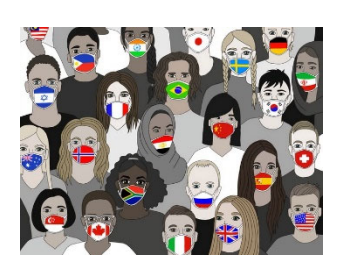
#3 / Health Disparity and Public Space in High Density Environments