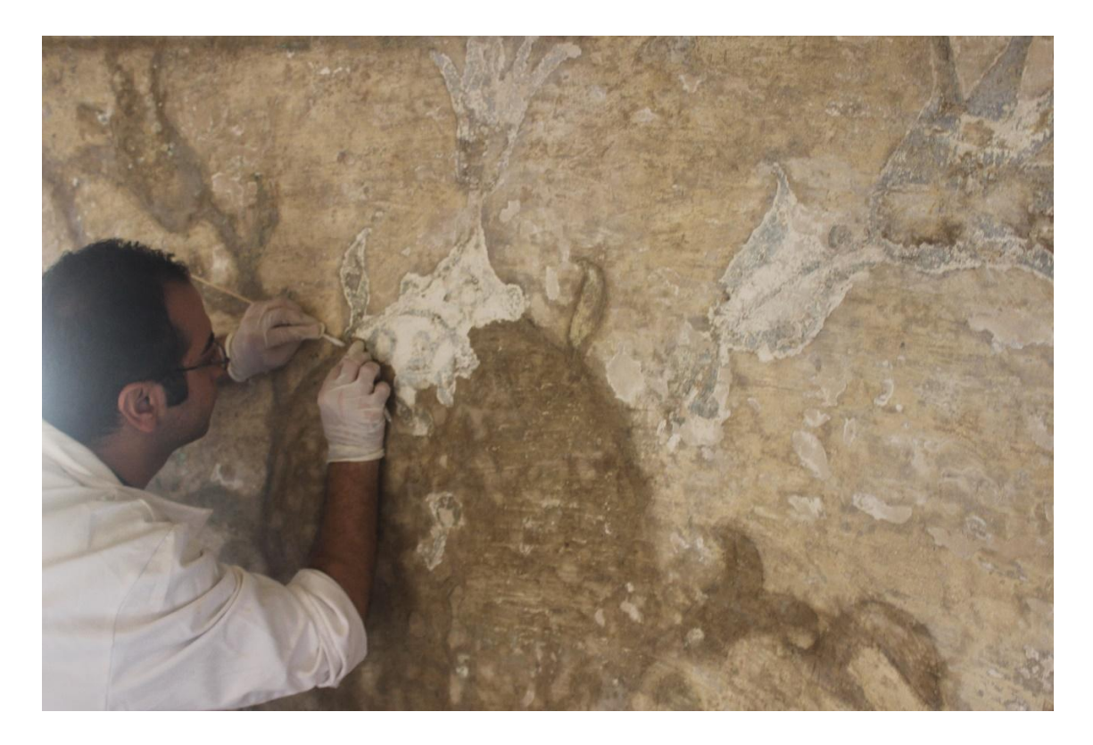
Figure 4. Decorative stucco conservation - Shajar al-Durr Conservation Project

By the time the mural of the shisha-smoking women was being considered, Athar Lina Initiative had conducted a heritage education program in one of the local primary schools, and started preparing for its own heritage summer camp for local children in an early 20th century building it was rehabilitating for that purpose. It had also obtained funding for the first in the line of a series conservation efforts, Shajar al-Durr Dome Conservation Project<sup>3</sup>. The team had already understood that one of the hazards of development work was the failure to understand the dynamics of the neighbourhood of intervention. Socio-economic patterns needed to be studied, tapped into, and built on. Insensitive actions, however small, could cause a ripple effect that could undermine the work in its entirety. This is why we were apprehensive of the radical choice of artist, however well-justified, to push a feminist agenda and impose women onto the sphere of public space if only through visual representation. The coffee-owner, however, was delighted. 'Amm Mustafa, a 60-something gruff man loved the drawing and his judgment proved to be sounder than ours. The women were not just accepted; they were appreciated and soon became a landmark that brought the coffee shop more business. It became common for strangers visiting the neighbourhood, for its many mawlids (saint day celebrations) for example, to meet at "the coffeeshop with the women".