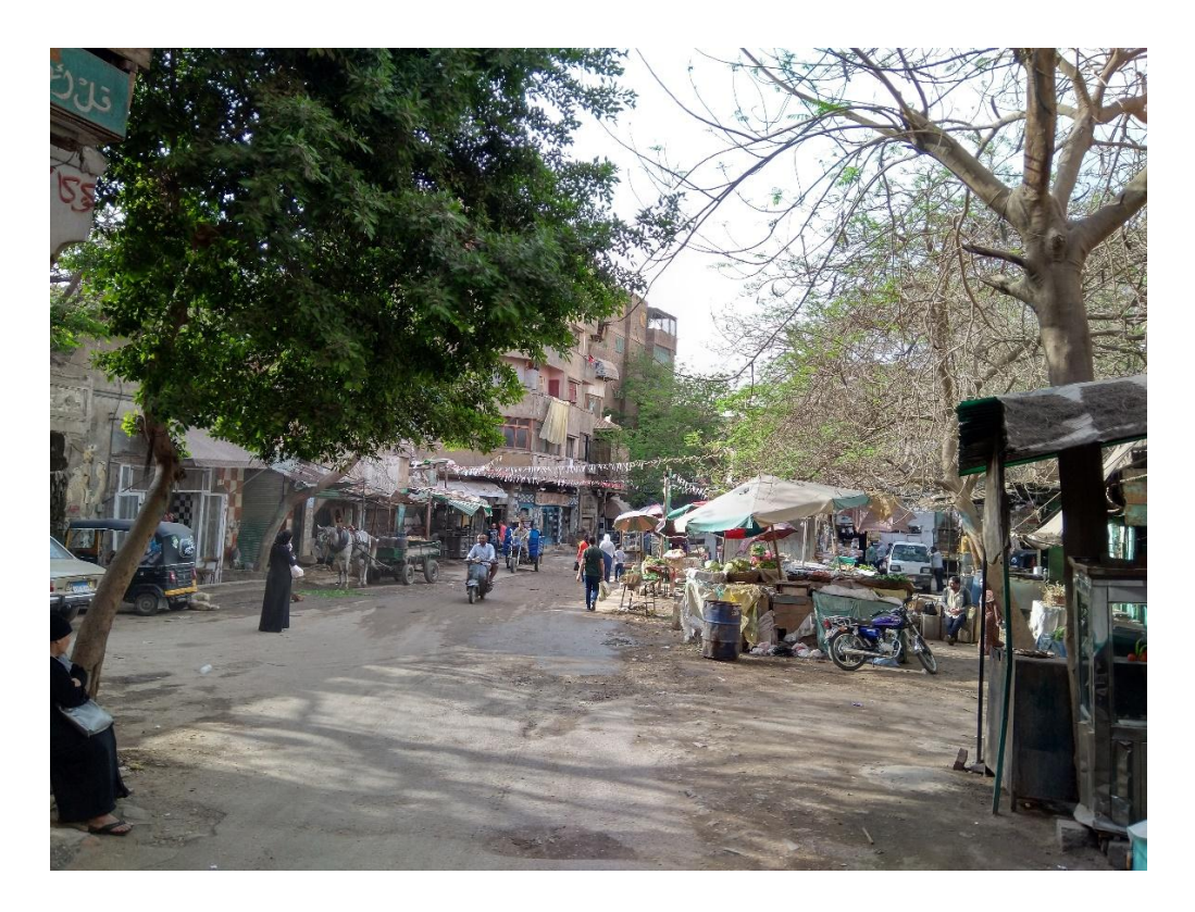
Figure 5. Market street in al-Khalifa