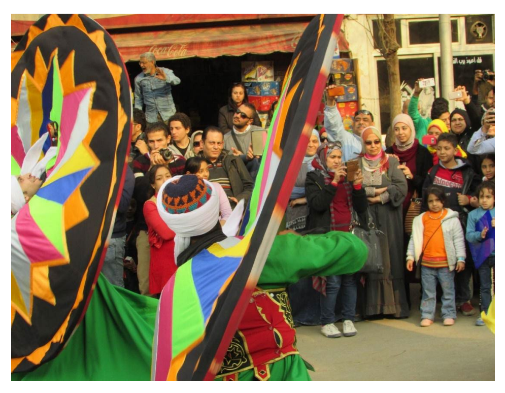
19. Tannura Performance in Ibn Tulun Street

By 2019, the map of heritage management had changed quite drastically. While many professional practices and non-governmental actors continue to function and adopt an integrated participatory approach, new State policies tend to gravitate towards ambitious projects that are fast, large and top down. The current work on widening streets and building bridges, many of which cut through historic neighbourhoods, is a case in point. The State has also tightened its control over civil society. Access to public space, and funding and the ability to work directly with communities is monitored and controlled. On a positive note, this means that the State has assumed more responsibility for the city. For example, in al-Khalifa Street, the government is currently implementing a massive project to resolve the issue of groundwater, develop and promote a tourist itinerary and upgrade streets and buildings along that path.