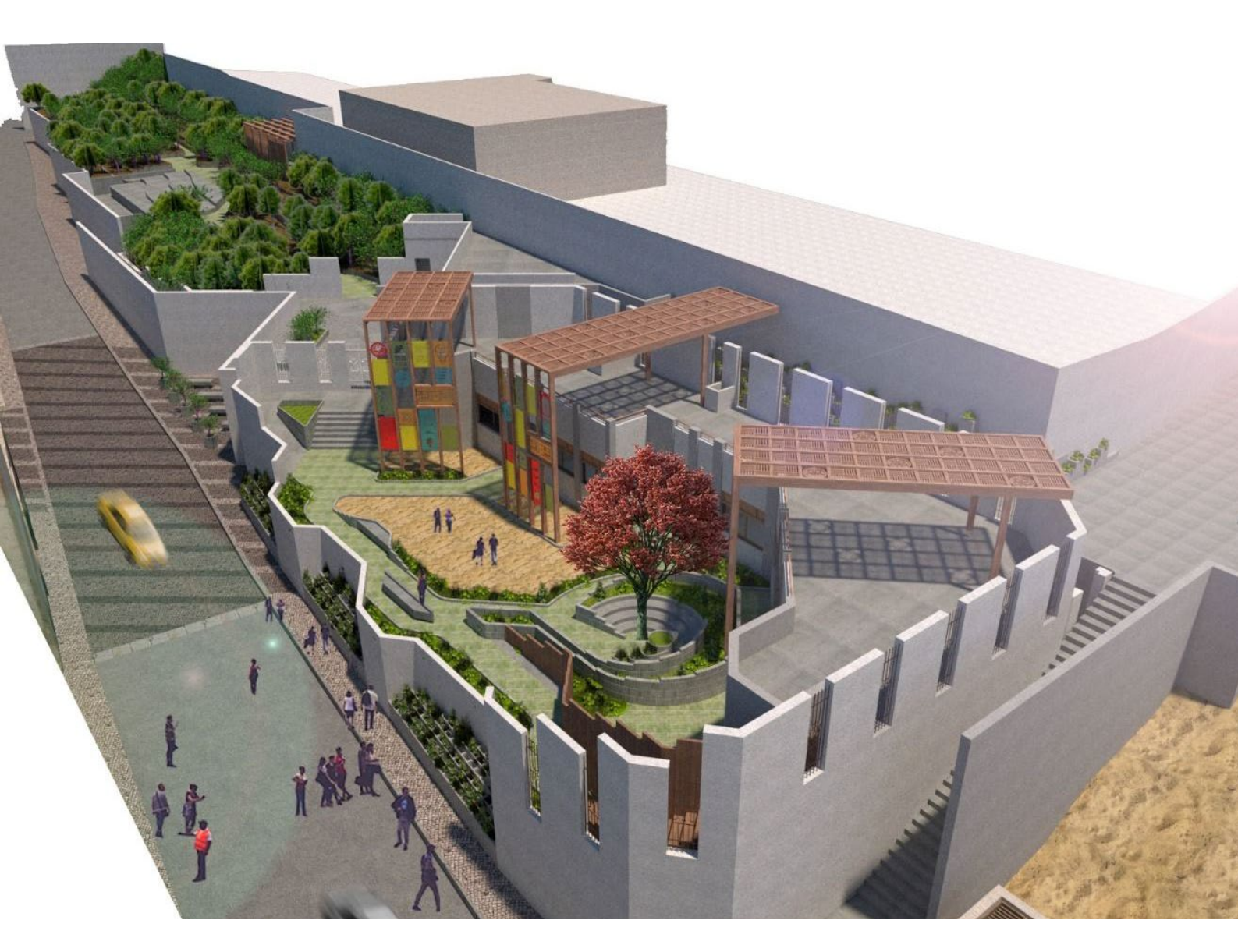
Figure 10. Proposed design for al-Khalifa Heritage and Environment Park © Athar Lina

design the park, Athar Lina conducted a needs assessment and accessibility studies through field surveys and participatory workshops with youth, women, and children.