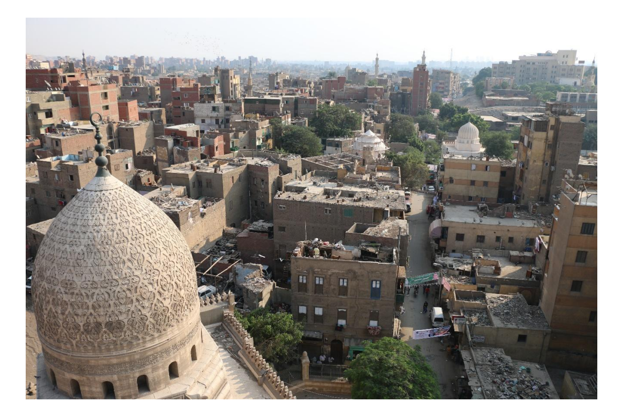
Figure 2. View of al-Khalifa Street Area from al-Sayyida Sukayna Mosque