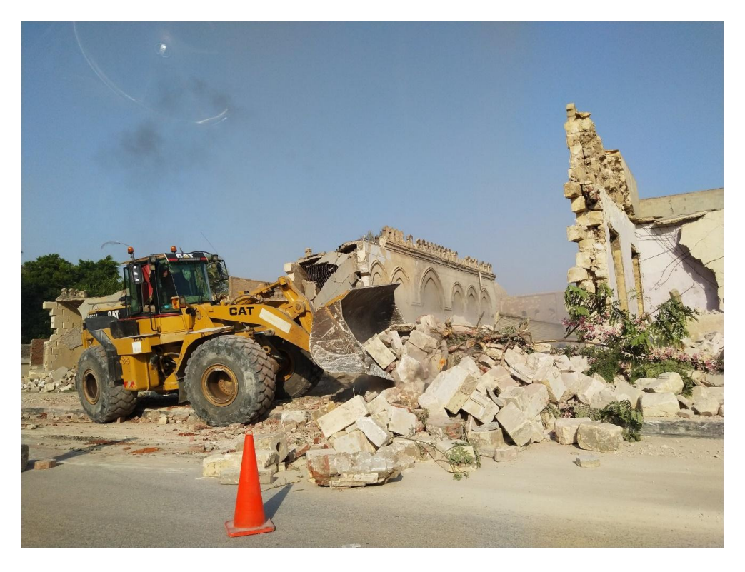
Figure 18. Demolition of sections of Cairo's historic cemetery to make room for bridges and widen roads