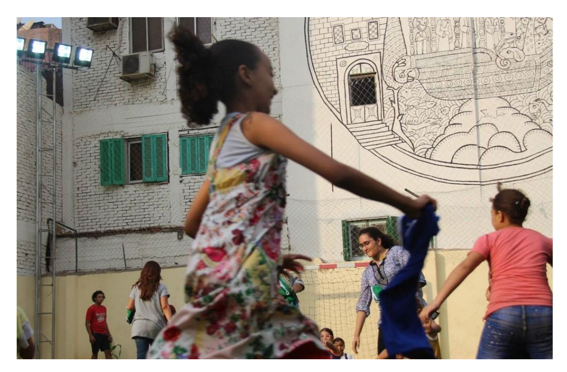
Figure 16. Children playing in Darb al-Husr Football Pitch designed by Athar Lina and implemented by Cairo Governorate

Another issue facing us today is the need to reconcile our work with the current State preference for ambitious top-down interventions in which there is little to no consultation with civil society. This is reflected in the ability to organise, mobilise and shape public space. On the bright side, Athar Lina is fortunate because its work comes under a mandate of heritage and conservation and as such, is seen as a benign activity that the State encourages civil society to participate in. The antiquities authorities' support is invaluable in this regard and it is the result of an incremental process of trust-building that started in 2012.