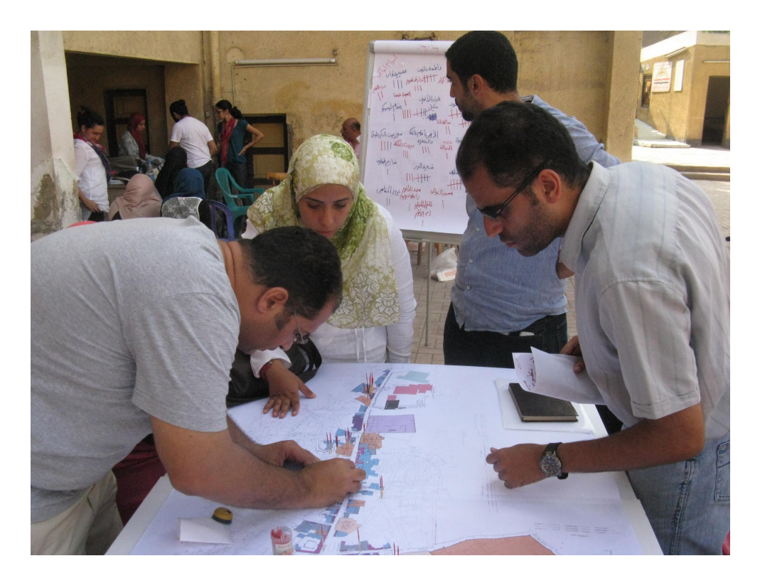
Figure 17. Collaborative mapping exercise in 2012 including a government official, academic and urban development expert