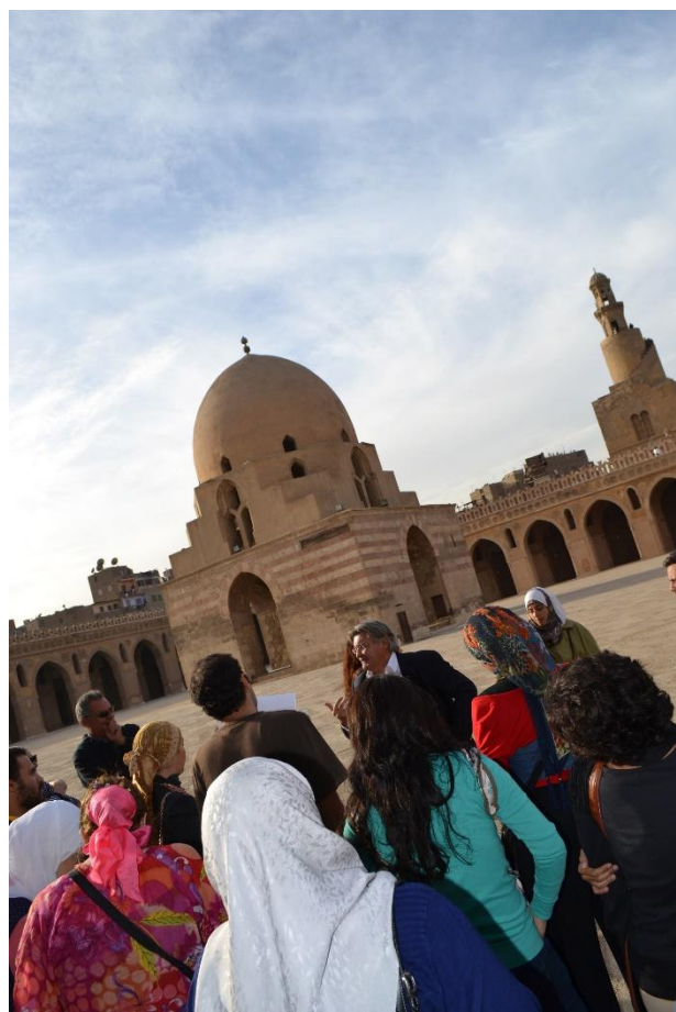
Figure 6. Storytelling performance by Chirine El-Ansary © Athar Lina