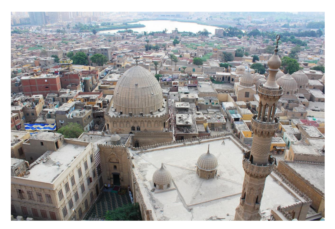
Figure 15. Al-Imam al-Shafi' Mausoleum with al-Shafi'i cemetery and 'Ayn al-Sira Park in the background