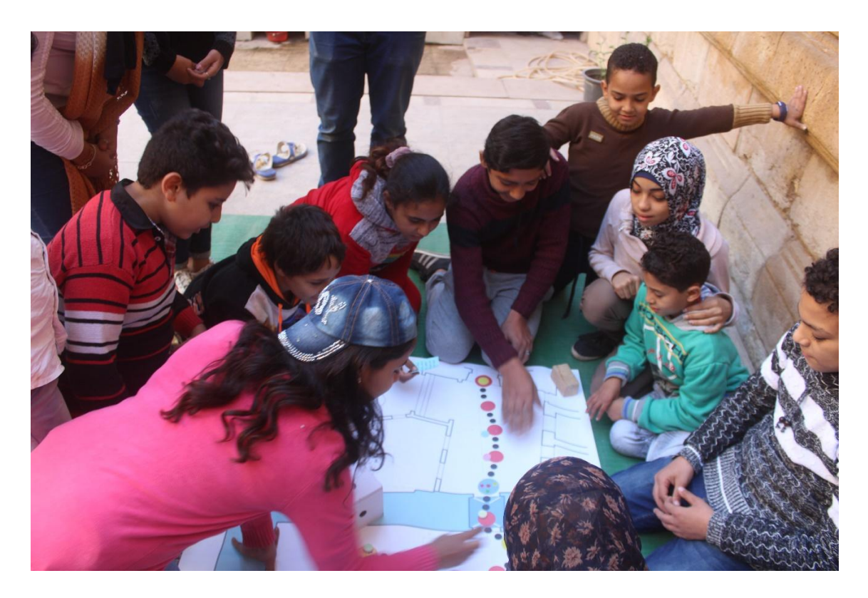
Figure 8. Shafi'i Dome Game – Spend Your Day in Khalifa 2018

We have also used the opportunity to promote our own work and fundraise for our Khalifa Heritage Summer Camp for Kids which until 2018 was mostly funded from the revenue of this festival.