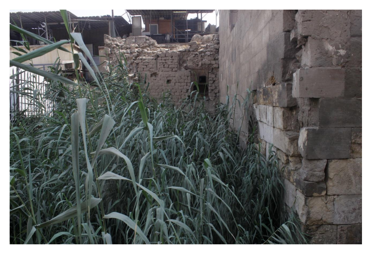
Figure 9. Groundwater damage at al-Ashraf Khalil Dome in al-Khalifa Street