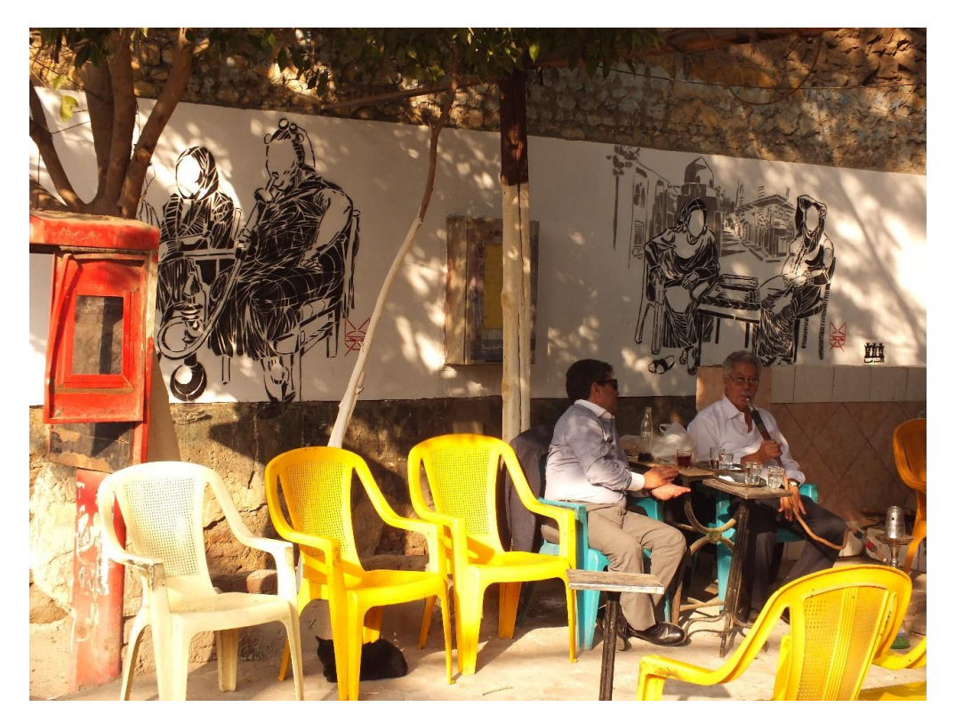
Figure I. Al-Khalifa Women Mural designed and implemented by Agnes Michalczyk © Athar Lina