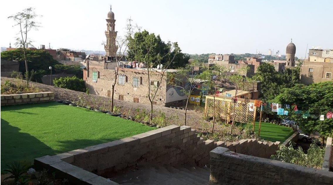
Figure 11 and 12. Al-Hattaba Community Garden before and after construction