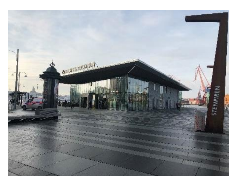
Figure 4. In front of the public transport terminal, a bicycle lane crosses the pedestrian area, with no warning signs or differences in materials, colours or contrast. The two departments involved have different views on such solutions.

In front of the terminal, a bicycle lane crosses a pedestrian zone with no warning signs or contrasts. The possible design choices had been discussed intensively during the process. The two involved departments had two completely different views on traffic safety in this kind of environment, which led the building department to try to sidestep the policies of the traffic department: "We are thinking safety , while they are thinking security. We do what we can to get around their policies here." (Interview 2) Ambitions to improve safety in the city were also identified as an area of conflict when it comes to other design choices supporting UD. Outdoor elevators have been classed as unsafe areas by one department. In this hilly city, this policy has produced excluding outdoor areas, and the reluctance to build outdoor elevators has not, so far, led other departments to reach a consensus on solutions that can be accessible and usable by all.