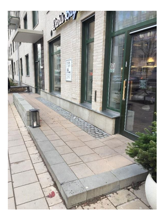
Figure 5. The standard requirement to create a level difference between the entrance level and the street level is an underlying factor, resulting in a special solution, separating people at the entrance. Still, there is a clear possibility to create an equal solution by bridging the level difference with a ramp inside the store.

environments. One of them was the trend of including stairs in the planning of outdoor public places, also where the terrain was originally not hilly. In combination with the policy to avoid the installation of outdoor elevators, this creates excluding public environments. Other potentially excluding trends were the policies to build closed blocks and place the buildings' facades on the property boundary. These principles are perceived as urban environmental qualities but can create barriers and reduce possibilities for an inclusive design.