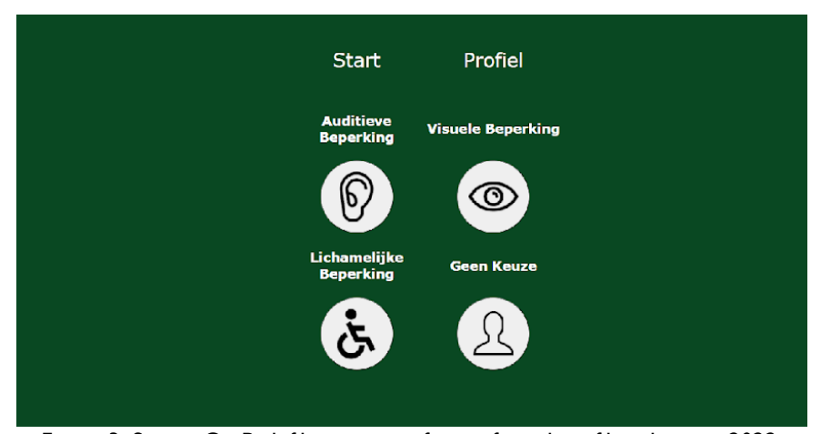
Figure 3. Samen Op Pad, filter options for preferred profile selection, 2022.

filter whether you would like to find results in the categories of leisure, healthcare and wellbeing, municipal information or within the field of education and jobs. The matching results are presented in an online map that indicates accessibility qualities of buildings and facilities surrounding youWhereas the pilot project is currently taking place in The Hague, the application with its corresponding data is freely available and can be used anywhere.