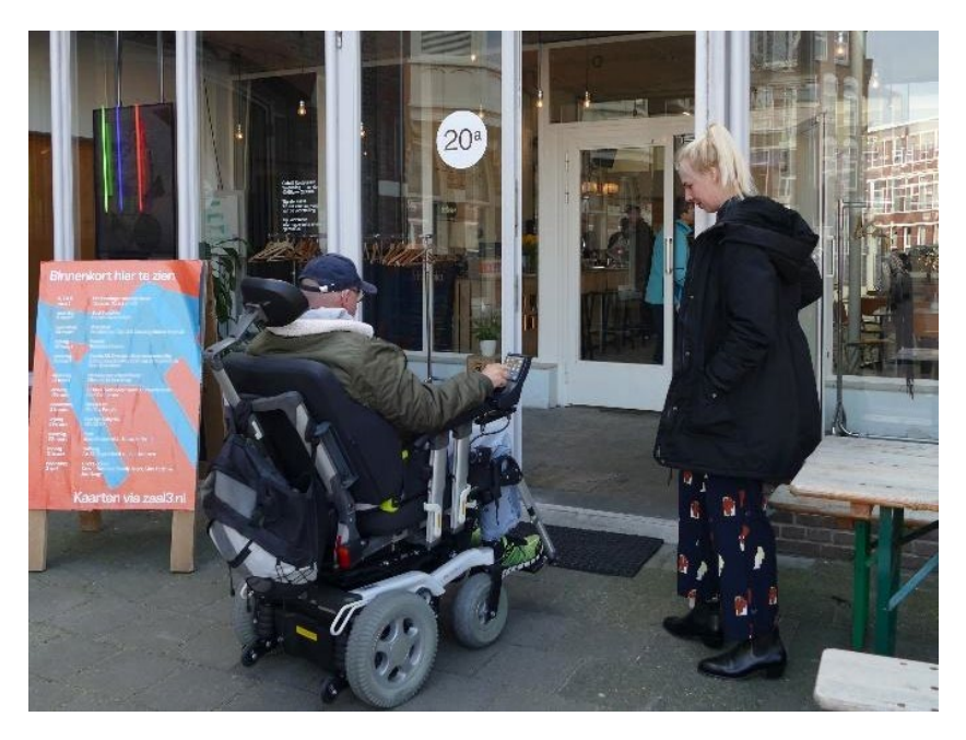
Figure 2. Voorall Foundation, An accessibility test of a theatre entrance.

The fact that the foundation's volunteer pool is extremely popular indicates that many people, especially people with disabilities, feel the need to endorse a more accessible public space. Early involvement of people with disabilities in urban development plans are an efficient way to work towards an inclusive city plan. Research from the World Bank indicates that building in line with the inclusive design principle renders a mere one percent increase of costs compared to the current status quo.<sup>3</sup> Strikingly enough, the involvement of people with disabilities within urban development projects is still rather unique and remains a world to win.