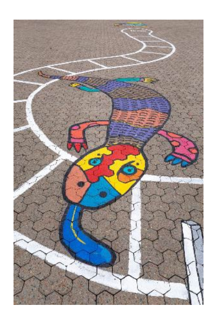
Figure 6. Detail of Snakes and Ladders , 2021, by Digby Webster and Nadia Odlum. Alt text: A blue-tongued lizard painted on the ground, joining two spaces in the Snakes and Ladders game. The lizard is poking out a long blue tongue with a yellow stripe.

Digby and Nadia approached the collaboration as equals and partners from the outset. The artists met for multiple site visits, exploring Station Square and the surrounding Sydney Olympic Park precinct and wetlands for inspiration. Through discussions about their artistic interests, and buoyed by a mutually playful attitude, the pair decided upon the direction of creating an artwork that was interactive. When brainstorming ideas of popular games, it was Digby who first suggested snakes and ladders. This immediately stood out as a good way to combine their different styles, and to divide up the artistic responsibilities. Nadia took care of the game board and ladders, while Digby created drawings of the creatures in his home studio, which were then scaled up and painted on the project site.