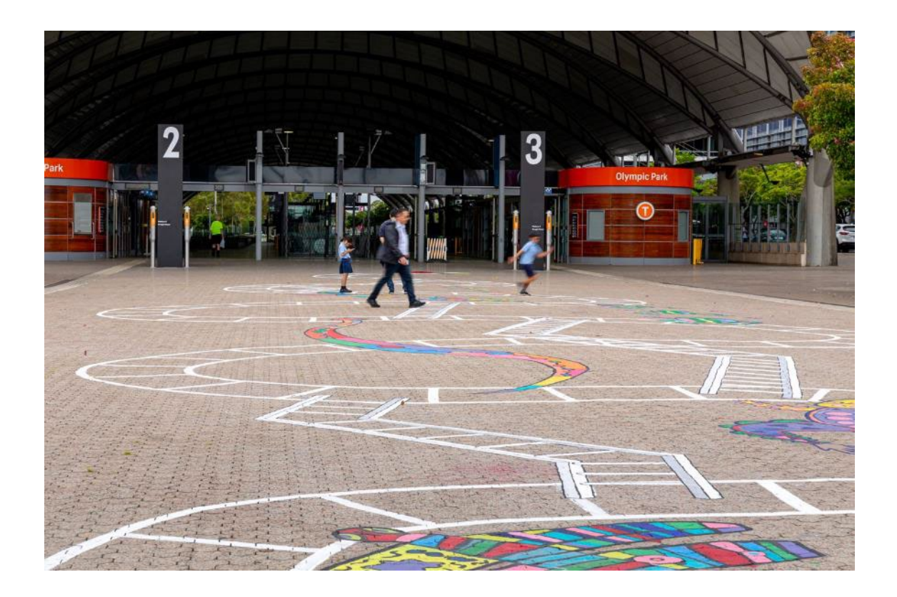
Figure 11. Snakes and Ladders, 2021, by Digby Webster and Nadia Odlum. Synthetic polymer paint on pavement, 5,000 x 800 cm, Station Square, Sydney Olympic Park, Sydney, Australia.

Inclusion was at the forefront of the artists' minds when selecting a game to base the artwork on. Snakes and ladders is a classic board game that is well known in many cultures, and across generations. The instructions are simple to explain, and success is based entirely upon luck, making it a level playing field and an engaging game for everyone. Digby says: "I am very proud, for everyone who's out there playing with that game. In their mind they are saying, 'Oh, I grew up with this game." (Webster, 2022)