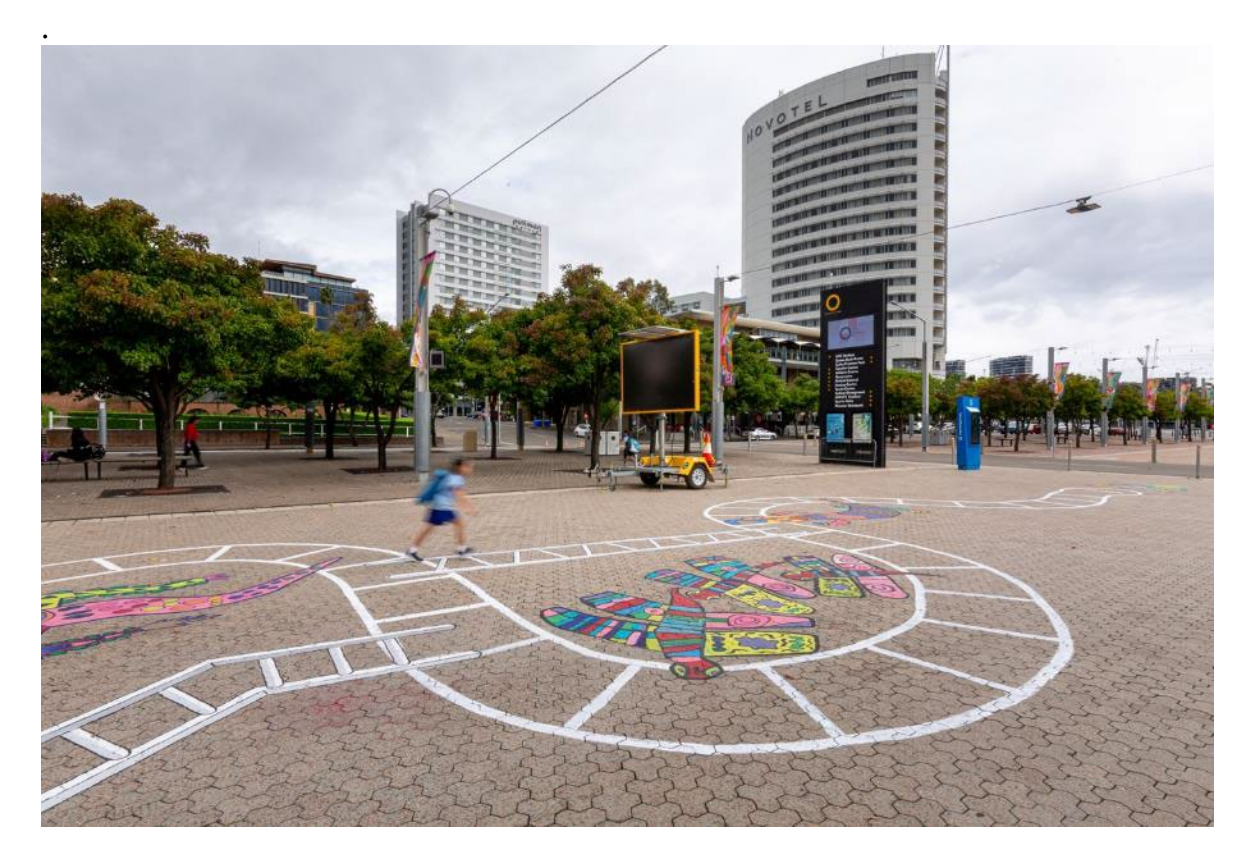
Figure 9. Snakes and Ladders, 2021, by Digby Webster and Nadia Odlum. Synthetic polymer paint on pavement, 5,000 x 800 cm, Station Square, Sydney Olympic Park, Sydney, Australia. Alt text: A detail of the Snakes and Ladders mural, painted on the ground. A child is walking along a painting of a ladder with crooked rungs.

Rights of Persons with Disabilities outlines the right to full participation in cultural life, recreation, leisure and sport. In particular, it states that parties must take measures "to ensure that children with disabilities have equal access with other children to participation in play, recreation and leisure…" (UN General Assembly, 2017) The International Play Association identifies that in order to enable all children to enjoy their right to play, it is essential to "remove disabling barriers and promote accessibility" in the space that play occurs (International Play Association, 2015). Similarly, in a new set of guidelines from the NSW Department of Planning and Environment titled "Everyone Can Play", designers of inclusive playspaces are encouraged to answer three questions: "Can I get there? Can I play? Can I stay?" (NSW Department of Planning and Environment, 2021) This highlights that inclusivity in playspaces goes beyond physical accessibility. The whole of the play experience, and the environment it occurs in, must be considered. This is in line with the commitment outlined in the New Urban Agenda, and in Goal 11 of the Sustainable Development Goals, to create safe, inclusive public spaces that support access for all (United Nations, 2017, p. 13, and United Nations, 2016).