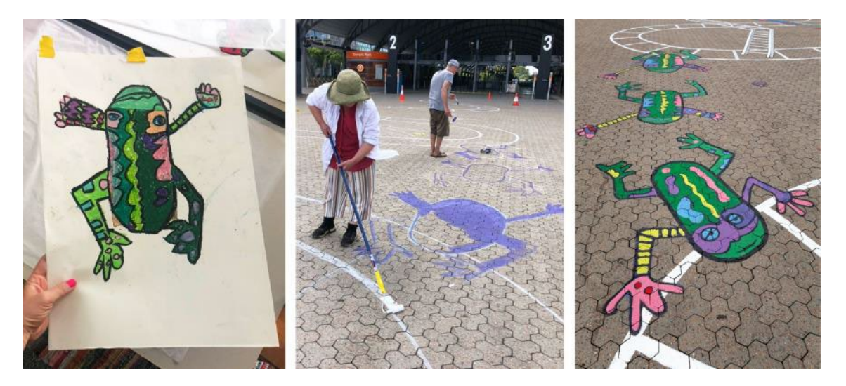
Figure 7. An example of how Digby's original drawings were scaled up and translated into the Snakes and Ladders mural.

Digby and Nadia approached the collaboration as equals and partners from the outset. The artists met for multiple site visits, exploring Station Square and the surrounding Sydney Olympic Park precinct and wetlands for inspiration. Through discussions about their artistic interests, and buoyed by a mutually playful attitude, the pair decided upon the direction of creating an artwork that was interactive. When brainstorming ideas of popular games, it was Digby who first suggested snakes and ladders. This immediately stood out as a good way to combine their different styles, and to divide up the artistic responsibilities. Nadia took care of the game board and ladders, while Digby created drawings of the creatures in his home studio, which were then scaled up and painted on the project site.