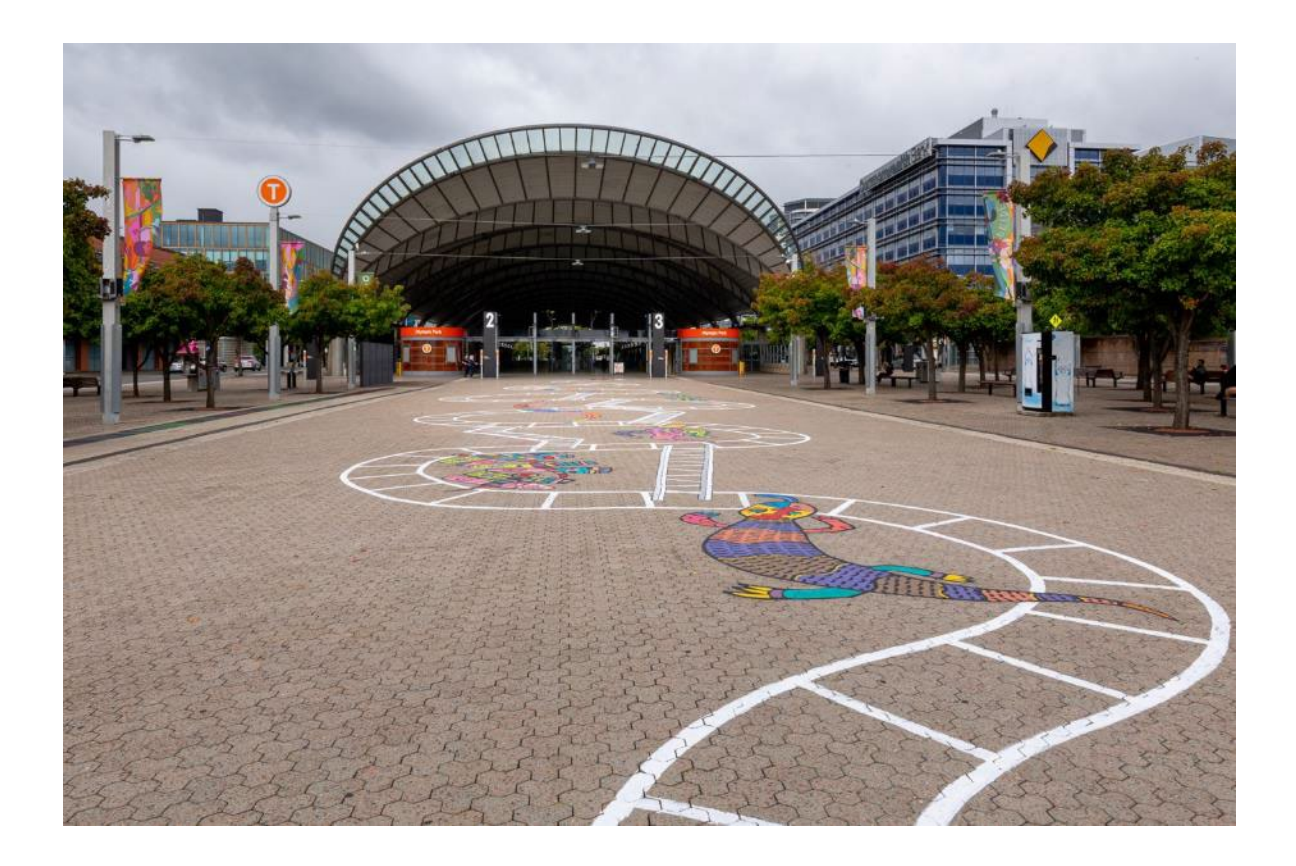
Figure 10. Snakes and Ladders, 2021, by Digby Webster and Nadia Odlum. Synthetic polymer paint on pavement, 5,000 x 800 cm, Station Square, Sydney Olympic Park, Sydney, Australia. Alt text: The Snakes and Ladders artwork meandering into the distance through Station Square. In the background is the Sydney Olympic Park train station.

The ground work for the success of the Snakes and Ladders artwork as an inclusive playspace was laid in the pre-existing attention to universal design in the surrounding urban environment. As the site for the 2000 Olympic and Paralympic games, access and inclusion was fundamental to the design of the public spaces of Sydney Olympic Park, including Station Square where Snakes and Ladders is located (SOPA, 2021c). The site is adjacent to accessible public transport and parking facilities. At the entrance to the station there are accessible bathrooms. Drinking fountains and nearby cafes provide water and refreshment (McClleland, 2010). Alongside the Snakes and Ladders artwork are benches set under trees, which provide a shaded spot for accompanying people to observe the game being played. These factors combine to allow children and caregivers to safely and comfortably stay at the site and to play in the artwork. This is an essential aspect in creating inclusive playscapes, for as the International Play Association identifies: "Disabled children have the same right as other children to sufficient time and space to play freely, in the ways they choose, without being unduly overprotected" (International Play Association, 2015).