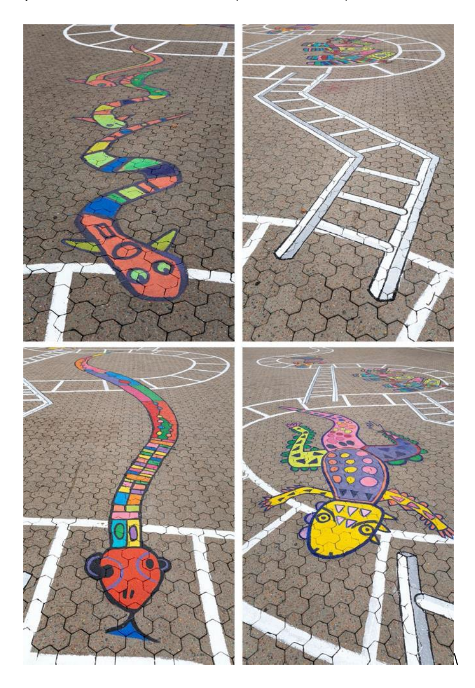
Figure 3. Details of Snakes and Ladders, 2021, by Digby Webster and Nadia Odlum. Alt text: Four photos showing details of the Snakes and Ladders artwork. Colourful creatures and white ladders are painted on brown pavers.

mixture of large-scale architecture, most notably in the form of the Olympic stadium, and parks and wetlands rich in biodiversity (Paul, 2020). In the Snakes and Ladders artwork, Nadia designed the segmented curves of the snake to echo the stadium and station architecture. Digby painted the native creatures after exploring and being inspired by the nearby wetlands. Digby says: "...I'm listening to the sound of wildlife animals, and water animals. And I thought, 'Let's make these animals from the water and sounds come to life.' It's easy to do. Paint, draw and voila!" (Webster, 2021b).