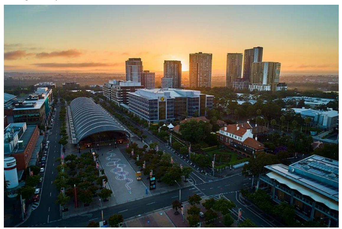
Figure 4. Snakes and Ladders, 2021, by Digby Webster and Nadia Odlum. Synthetic polymer paint on pavement, 5,000 x 800 cm, Station Square, Sydney Olympic Park, Sydney, Australia.

Alt text: Aerial view of the artwork Snakes and Ladders , and the surrounding suburb of Sydney Olympic Park. The artwork is in a large paved space outside a train station building with an arched roof.