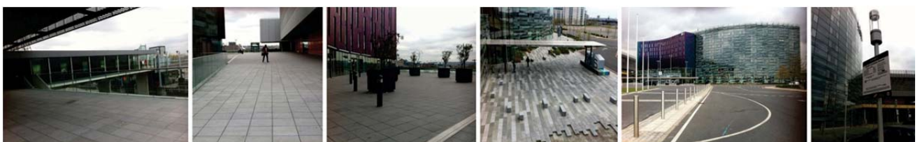
Fig. 5: Aloft Hotel.

Number 1 New Street Square is utterly privatized. (Concept 'a') Walking down the street, the development is easily perceived. Predominantly grey, the cluster of buildings has gaps in its corners, like spatial fissures that create a passage through the complex. On the other side, in a calmer street, the boundaries snakes the limits of public/private space, and as a lasso accommodate one more bench, in which a working class figure is seated. (Concept 'b') The pavement has straight lines of shade change, like the invisible barriers in the art of Marcus Galan. A small totem with chrome maps, information and a CCTV drawing marks the entrance of the urban fissure. Everybody is wearing suits, some passing by in a hurry. Two figures in black stand in the front of different buildings. As I walk around, I imagine if one of them is watching me, so I take hidden pictures. (Concept 'c') Entering the square, many people are seated in cafes, but only one person is seated on the square benches. In Land Securities website own words, the place is thus outlined: "There has been a real sense of magic around New Street Square since it opened, with the dramatically expanded public realm being used for everything from live sports screenings to local food markets".