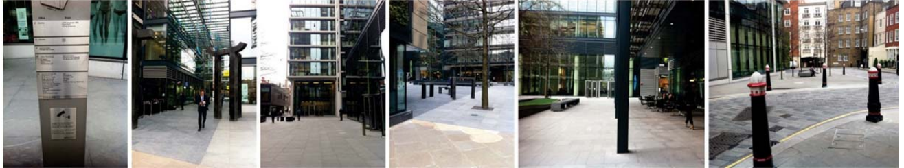
Fig. 4. I New Street Square.

The following lines will delineate these concepts among five of those spaces' experience, representing and describing five "gradations", from the most privatized space to the most public place (N.B.: the concepts do not emerge on the last example).