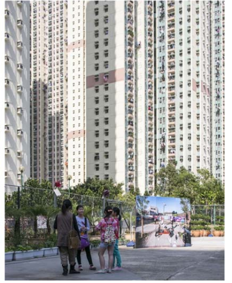
Pop-up City exhibition at Tin Shui Wai, Hong Kong, 2014.