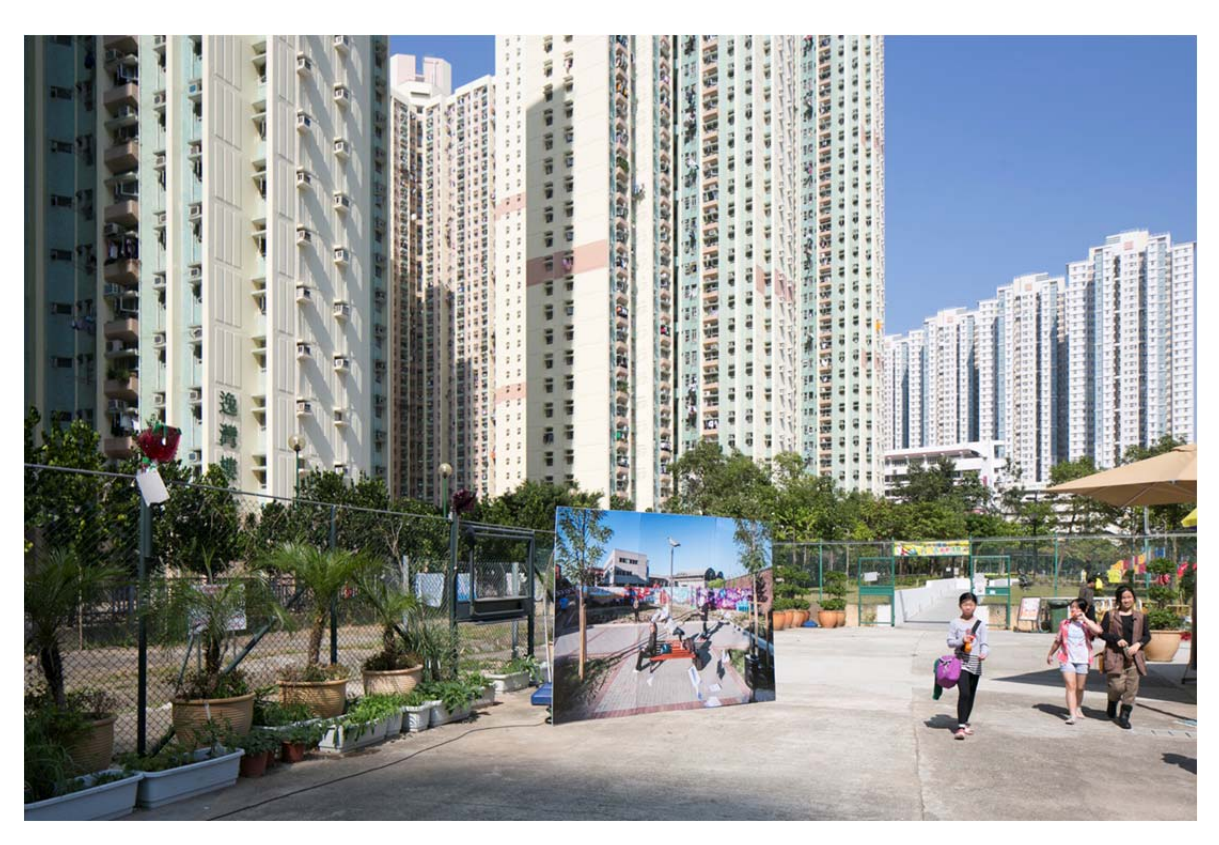
Pop-up City exhibition at Tin Shui Wai, Hong Kong, 2014.

The Magic Carpet project team at The Chinese University of Hong Kong and Tung Wah Group of Hospitals Tin Sau Bazaar hosted Pop-up City in Tin Shui Wai in 2014. Like suburban Italian neighborhoods, Tin Shui Wai is located at the margin of Hong Kong; its space has no identity; it lacks street spaces for communal encounters and microeconomic activities. All these result in the stigmatization of Tin Shui Wai with problems such as social isolation and a high unemployment rate.