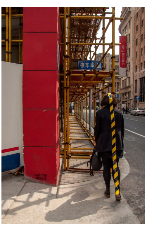
From top, clockwise. Fig. 3. Construction Gantry, Melbourne, 2015. Artwork: Grace Leone. Photo Credit: Grace Leone. Fig. 4. Construction Gantry, Shanghai, 2015. Artwork: Grace Leone. Photo Credit: Grace Leone. Fig. 5. Shanghai Scaffolding Intervention 1, Shanghai, China, 2015. Artwork: Grace Leone. Photo Credit: Grace Leone. Performer: C. McCracken.